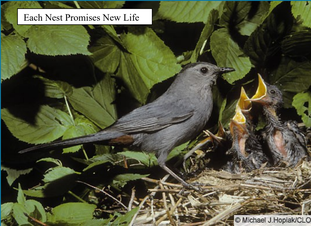
Each Nest Promises New Life

Prepared by Jim Cubie – former Nader consumer advocate