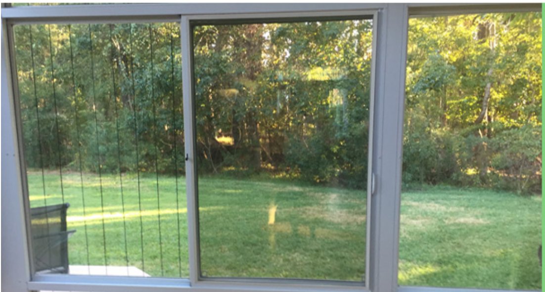
Bird Saver Fishing Line