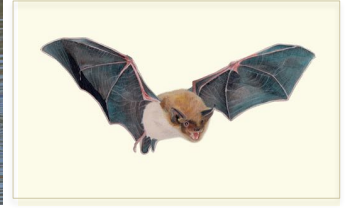
Summer Bats in August

As the pandemic winds down, Sea and Sage's Marsh Education Project is excited to offer three educational programs on a limited basis this summer at the San Joaquin Wildlife Sanctuary.