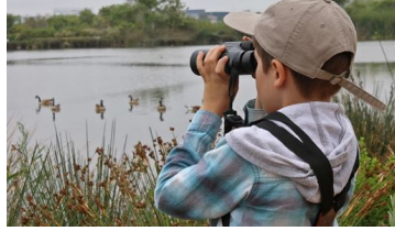
Nature Day Camps in July