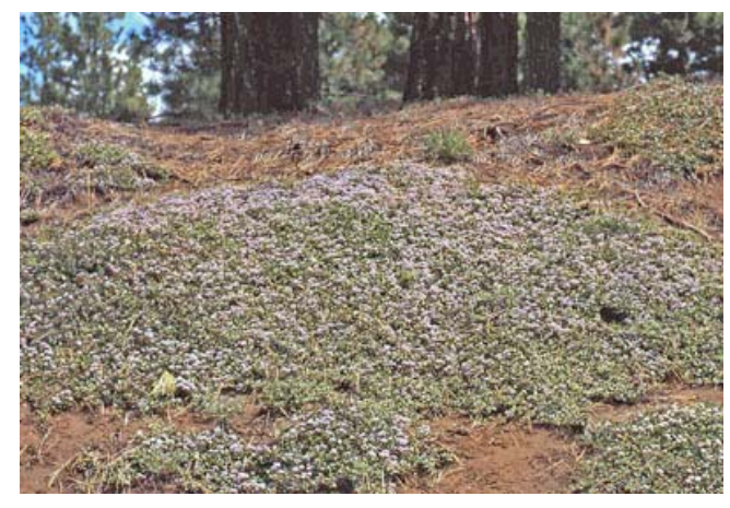
Maholo Mat (aka Squaw Carpet) Ceanothus prostratus Davis Lake, Plumas Co., CA

Squaw Carpet or Mahalo Mat, Ceanothus prostratus (also at Davis Lake). Forms carpets on slopes at the edge of the forest and in roadcuts. Stabilizes soil. I think I may have photos of this plant in fruit from MacArthur Burney Falls State Park.)