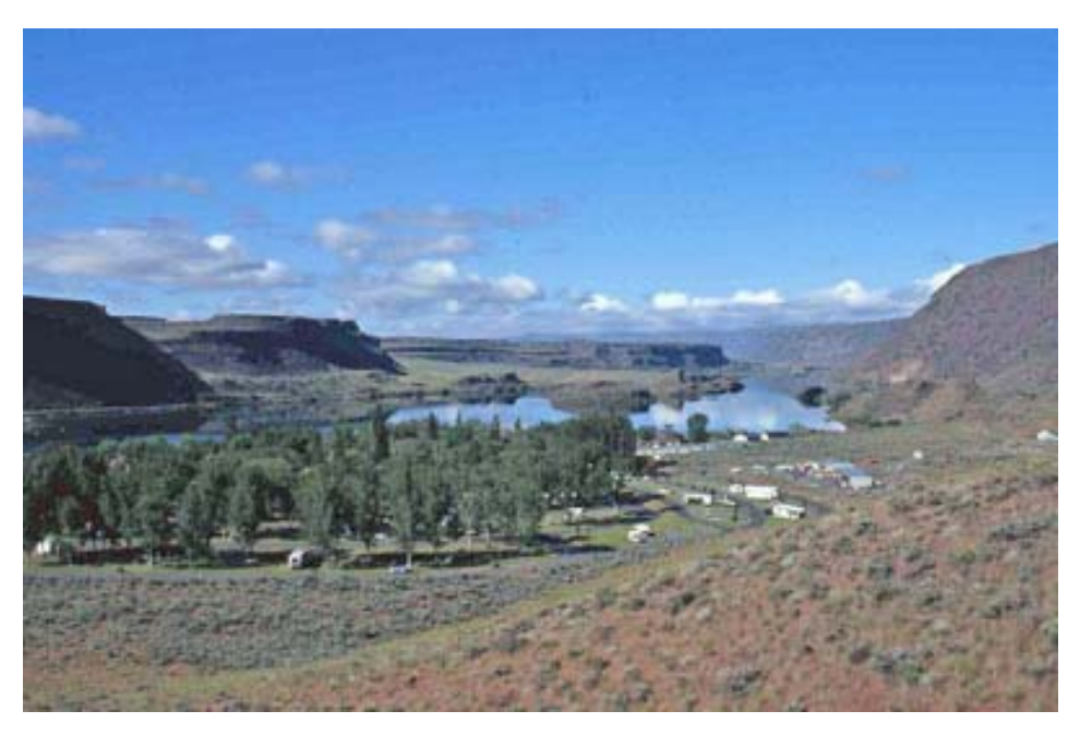
Dry Falls State Park from access road Grand Coulee, WA

We spent the rest of the day driving farther north, first on US 395, then on SR 17, ending up at Dry Falls State Park campground about two miles south of the Dry Falls overlook that I described in that 2008 diary.