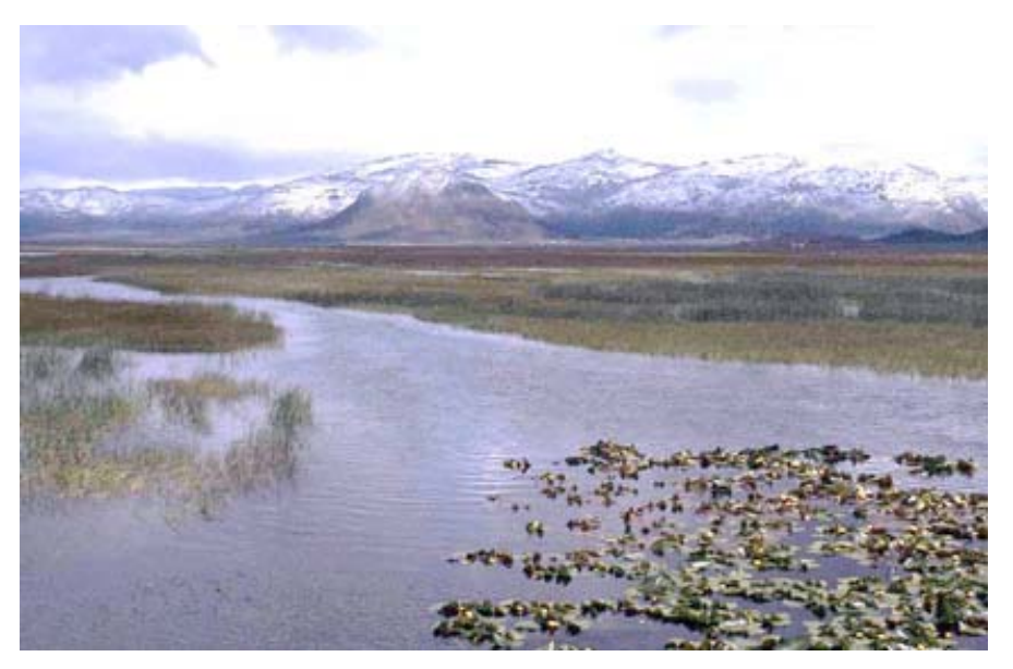
Sierra Valley Marsh and snowy mountains Plumas Co., CA

After breakfast we all went to the Sierra Valley Marsh and three of us walked the entire road from east to west with Jim trailing along in the truck to pick us up at the end. It was sort of calm at first and I got what may turn out to be an interesting mix of marsh bird sounds, but little else. We were pretty cold most of the time and had occasional slight flurries of sleet, but it was nothing like the last few days. When the sun came out and the wind died down for short periods, it was even downright pleasant. The scenery was spectacular--beautiful puffy clouds and a valley surrounded by snowy mountains with snow/sleet patches visible here and there all around.