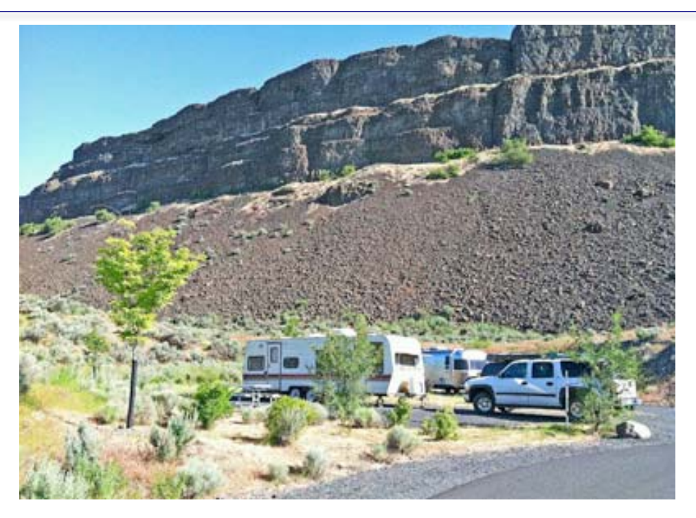
Campsite Dry Falls State Park, Grand Coulee, WA

Rock Wrens were singing on the slope and White-throated Swifts were flying around high in the sky, but nothing came to Jim's birdseed except Brewer's Blackbirds.