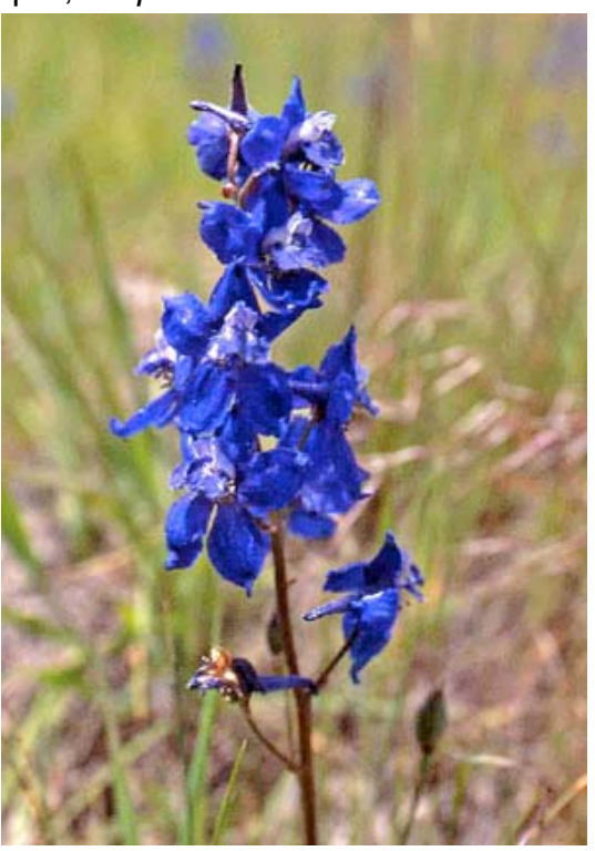
Upland Larkspur, Delphinium nuttallianum Sierra Valley Marsh, Plumas Co., CA

Sierra Valley Upland Larkspur, Delphinium nuttallianum