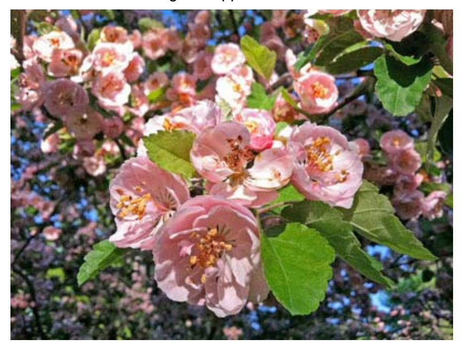
Flowering Crabapple – probably Clyde Holliday State Park, John Day, OR

I also photographed a beautiful tree in the campground covered with saucer-shaped pinkishwhite blossoms. I think it's a flowering crabapple.