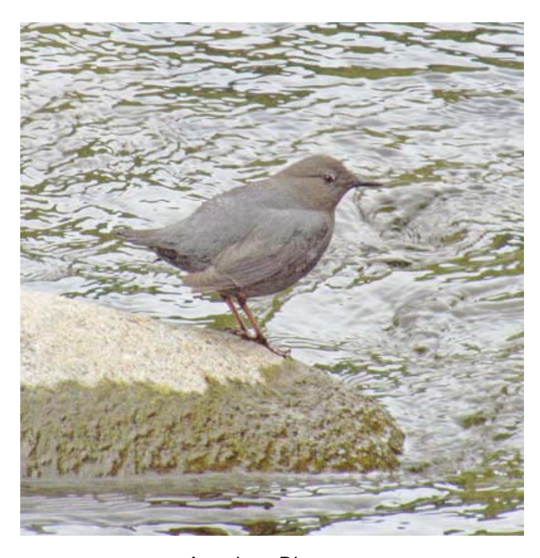
American Dipper Wild Plum Creek, Sierra Co., CA