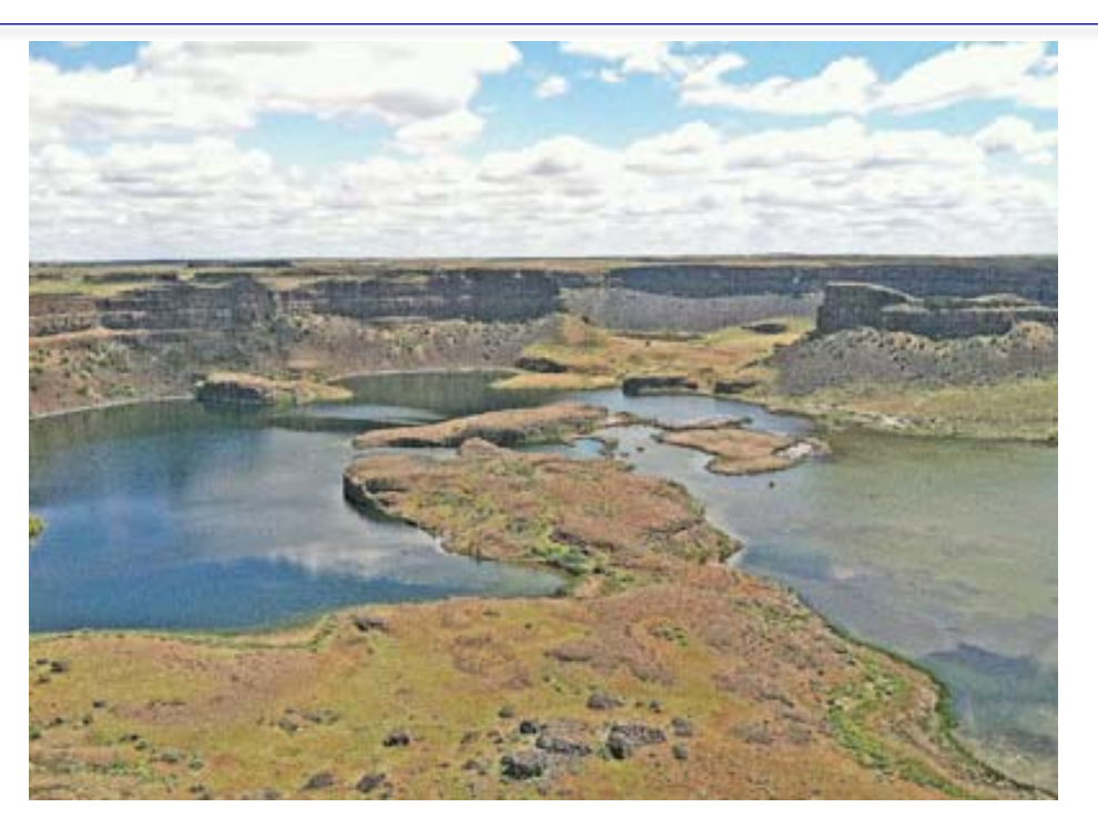
Dry Falls Grand Coulee, WA

The rest of the day was spent driving to Omak, WA, where we spent Thursday night, June 9, in the city park campground. It was nothing special, but adequate. It also gave me my last chance to email people before we turned off our 3G when we entered Canada.