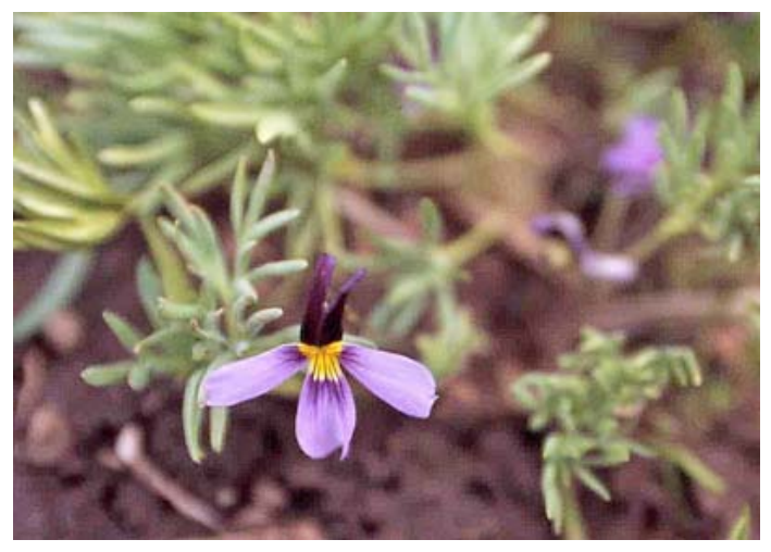
Great Basin Violet, Viola beckwithii Davis Lake, Plumas Co., CA

Great Basin Violet, Viola beckwithii (We debated whether it was this or Viola trinervata . Finally decided on this one.)