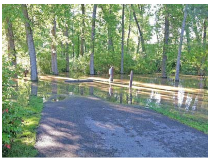
Flooded campsite Clyde Holliday State Park, John Day, OR

Donelda called her brother, who suggested a trick to try to get those lights to go off. Apparently the switch on the lower tailgate door on the truck sometimes acts up and doesn't turn off the lights when it closes. She tried that and it worked, so we were able to get on the road again early the next morning. Before leaving I wandered around the campground and over by the river. There's a nice gravel trail all along the river, but with the river so high much of it was flooded. I could only walk about 100 yards total. Even a couple of campsites were flooded. Snowmelt run-off is the cause of the flooding. I took a lot of photos with my iPhone camera.