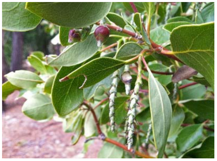
Fremont's Silk Tassel Bush, Garrya fremontii Madora Lake, Plumas Eureka State Park, Plumas Co., CA

Fremont's Silk Tassel Bush, Garrya fremontii (had fruit, tassels still in bud)