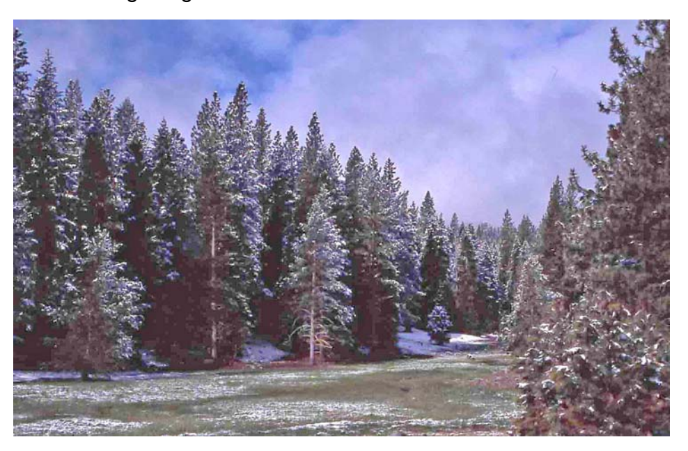
Snowy Meadow Between Clio and Calpine, near Sierra-Plumas county line, CA

We took the southern route to the Sierra Valley and on the way went over a 5300-foot, forested pass (Clio is at 4300 ft), stopping several places to take photos of the snow-covered trees. The snow was melting fast and falling off the branches in big glops. We had to stay out from under them to avoid getting wet.