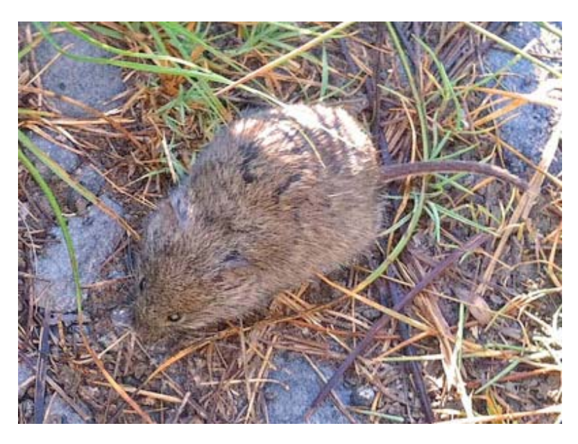
Townsend's Vole Dry Falls State Park, Grand Coulee, WA

Since the Dry Falls Visitors Center didn't open until 9:00, I decided we'd take the drive north along the Grand Coulee and look at all the geological features on our own. I'd immersed myself in the geology of this area so thoroughly in preparation for my just-finished workshop that I felt I could do a pretty good job as a tour guide on my own. We drove north along the Grand Coulee to Grand Coulee Dam. Most people probably think the Columbia River runs through the Grand Coulee, because of the name of the dam. Actually the river runs west, then south in its own course and only ran through the Grand Coulee when blocked by tongues of the Cordilleran Ice Field during the Pleistocene--and of course during the flooding events. It took that route to skirt the high plateau of lava, created by millions of years of lava flows. These lava flows were only under water during the floods. Thus the Grand Coulee is really mainly a record of the floods and is just the largest of many channels in the "channelled scablands."