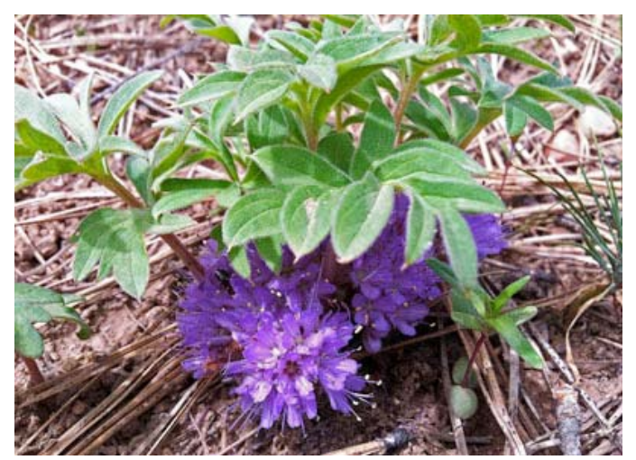
Ballhead Waterleaf, Hydrophyllum capitatum Davis Lake, Plumas Co., CA

Ballhead Waterleaf, Hydrophyllum capitatum . (Interesting because flower clusters grow under the leaves, which seem to serve as parasols or umbrellas)