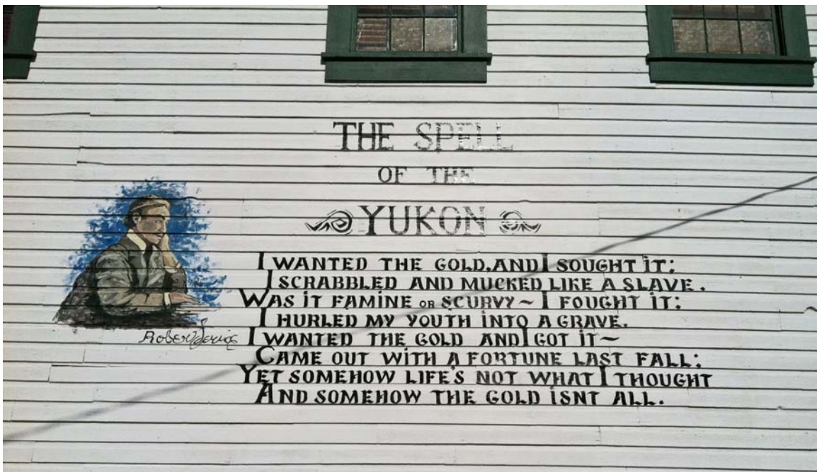
Robert Service quotation on building, Dawson City, YK