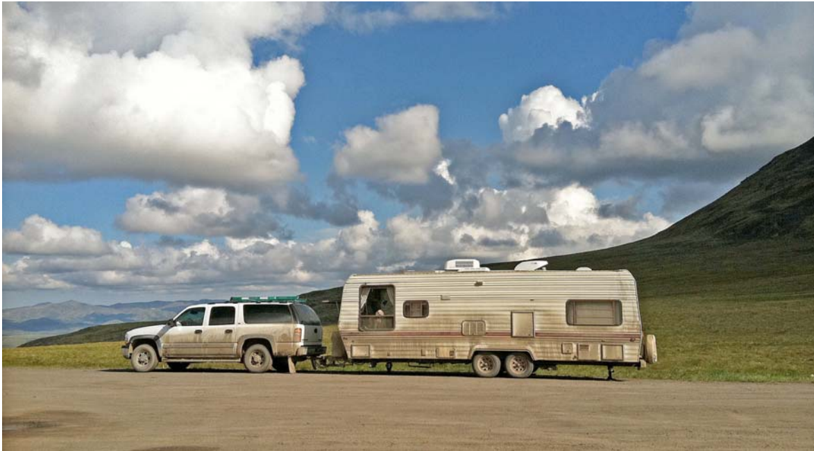
Dirty vehicles (Toby looking out cleaned window) Roadside rest campsite, Yukon-Northwest Territories border Dempster Hwy, YK

We stopped for the day at a roadside pullout at the Northwest Territories border. This is at the top of a pass, for the summit of the Richardson Mountains constitutes the YK-NT border throughout this area. When we reached the border, we lost an hour due to the time change, so it was 3:00 NT-time.