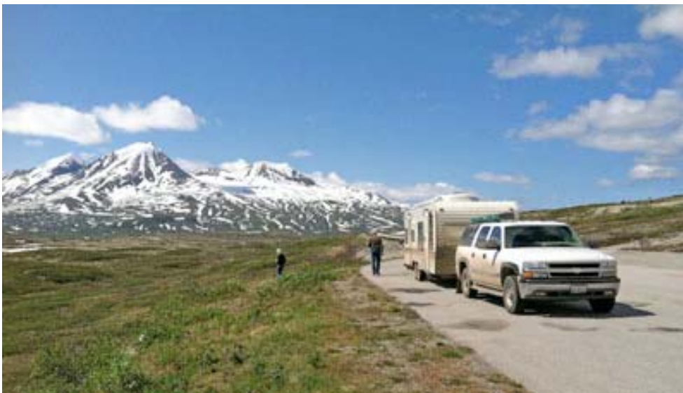
Chuck Creek trailhead parking area (boondock campsite) Near summit, Haines Hwy., BC

We recalled seeing a little green-and-white toilet building two or three miles back, and according to the list of interesting stops on the sheet we got at the visitors center, it sounded like Chuck Creek trailhead, which had been recommended for birds. It turned out that was correct. I didn't like the trail after about 100 yards, but the entire area on both sides of the road was pretty level with open shrubby willows of several species. I think there were also some alders, but I didn't work hard to find them. The parking area itself was well off the highway and we were able to find fairly level places to park. The open tundra and mountain peaks all around were spectacular and we loved it.