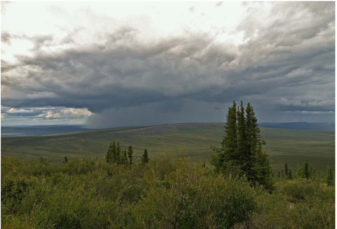
Approaching Storm From Eagle Plains Hotel campground, Dempster Hwy., YK