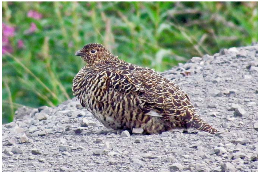
Willow Ptarmigan – female Blackstone Uplands, Dempster Hwy., YK