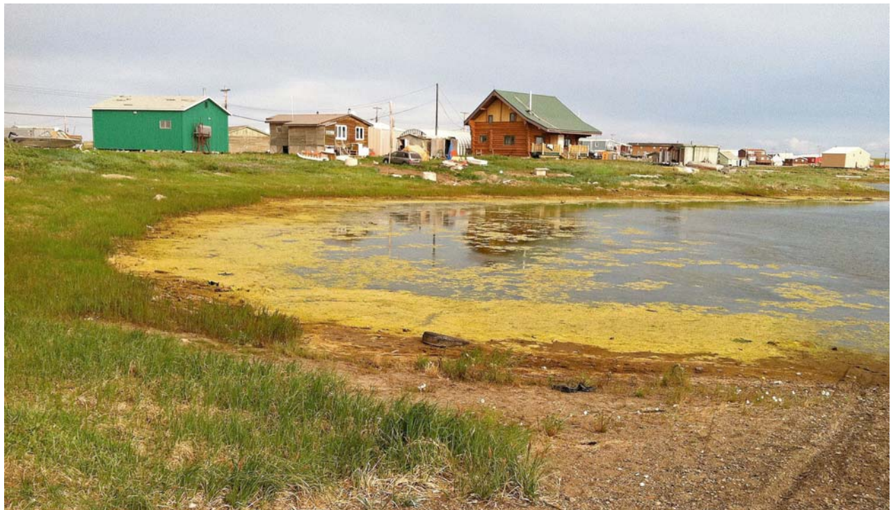
Buildings around cove Tuktoyaktuk, m NT