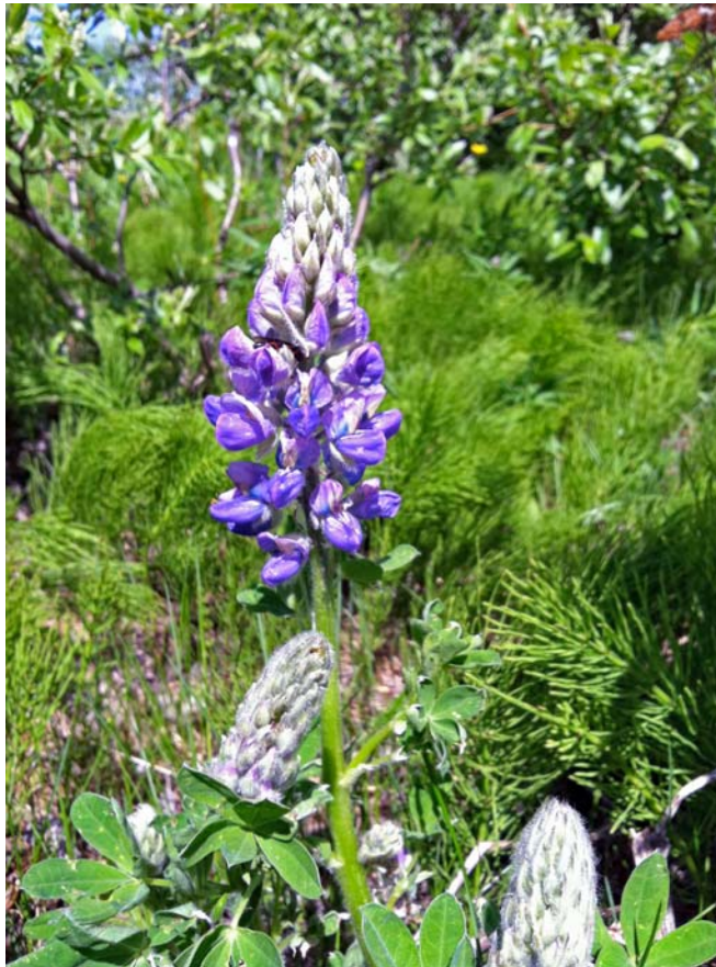
Arctic Lupine, Lupinus arcticus Chuck Creek trailhead area, near Haines Hwy. Summit, BC

I was fascinated by the lupine buds' adaptations to the cold: succulent and bristling with insulating "hairs."