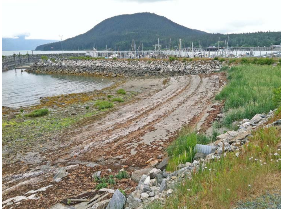
Beach and harbor from RV park Haines, AK

It certainly has more character than the one up the road. Across from the trailers are several picnic tables, spaced all along the edge of the drop-off to the rocky shoreline. Both evenings while we were there a group of campers who were more sociable than we got together and built a campfire near one of those tables and gabbed and sang until 10:00, when quiet hours started.