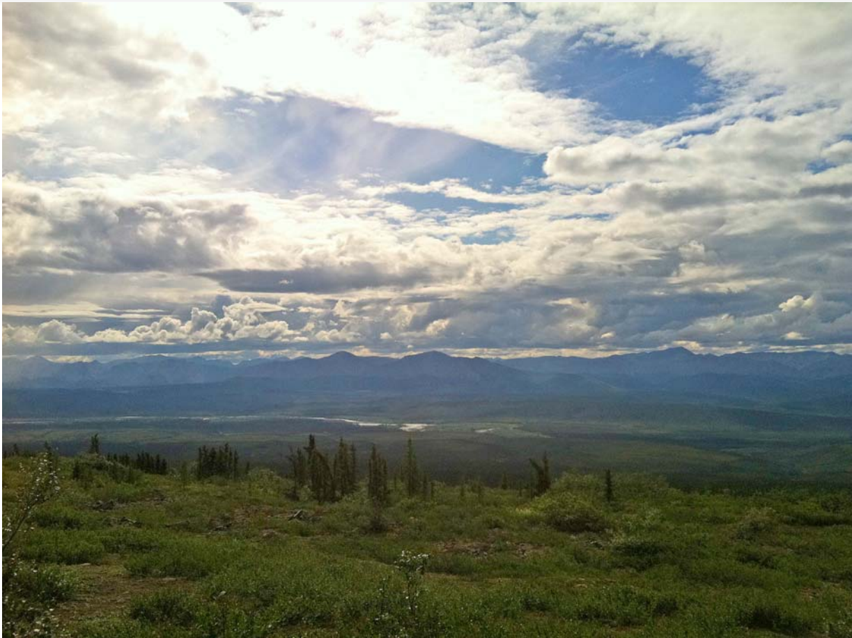
Valley of the Ogilvie and Peel Rivers From Eagle Plains, Dempster Hwy., YK

Then the road got really bad, so we could only drive 15-20 mph for long stretches. We had no incentive to stop, because Eagle Plains is sort of a monotonous monoculture of Black Spruce taiga, with occasional low shrubs, especially willows. We encountered occasional rain, but it was dry by the time we got here at Eagle Plains.