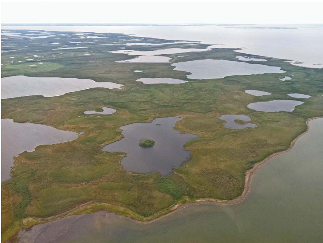
Pingos and Beaufort Sea From plane near Tuktoyaktuk, NT

Our first stop after leaving the airport in Tuk was at a pingo. (I had photographed a few from the plane.)