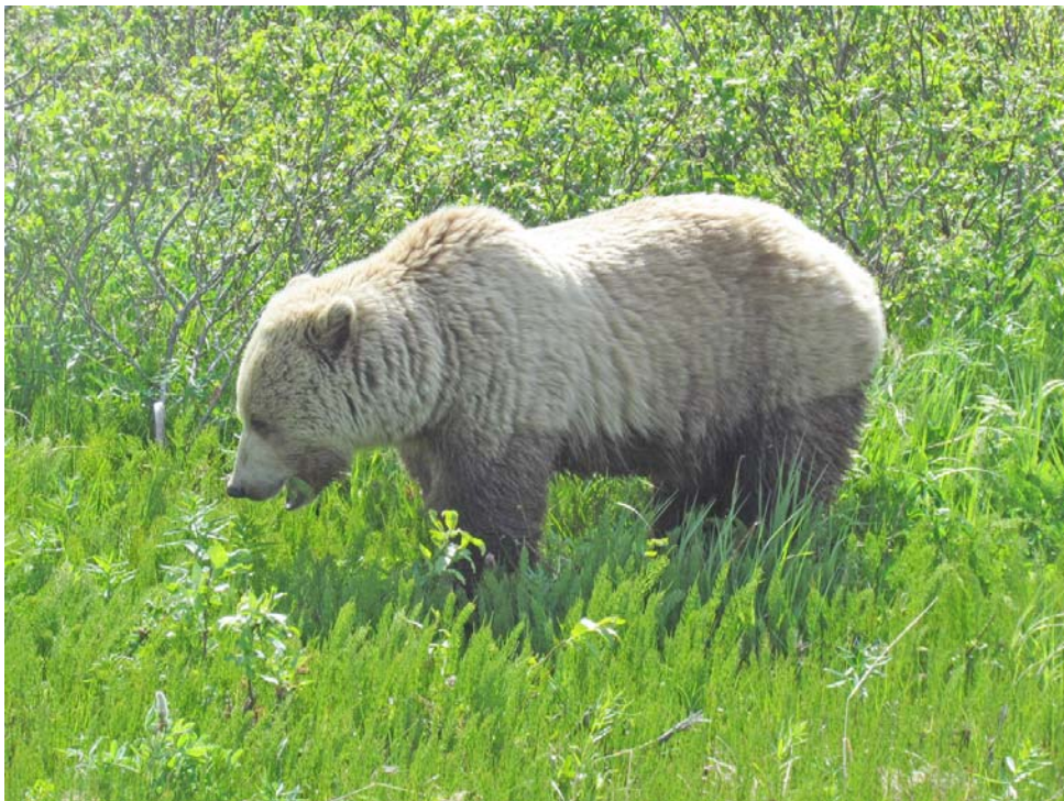
Grizzly Bear Near Haines Hwy. Summit, BC