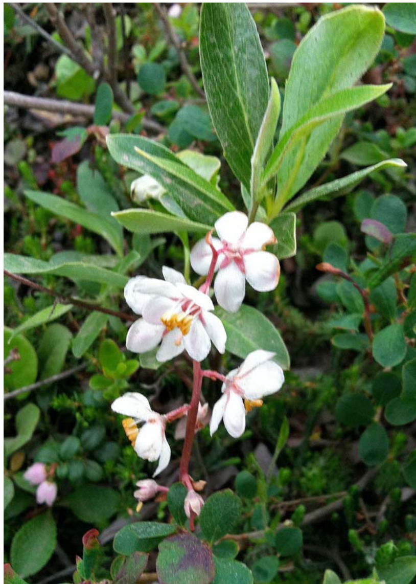
Large-flowered Wintergreen, Pyrola grandiflora Tuktoyaktuk, NT

These small hills are produced when a pond freezes over. The water under the ice is trapped on top of the permafrost and as it freezes, forces up the ice on top. This happens over and over, winter after winter. Eventually there is no more pond and the high-and-dry pond vegetation converts to soil, insulating the ice from summer melting. The process continues until a rather large hill is formed. The one we climbed had a gentle slope and was perhaps 30 ft high and 150 ft in diameter. We saw other, larger ones from the airplane. These pingos only last a few hundred years before the ice inside melts and they collapse. The sides of the pingo we walked on were covered with tundra shrubs and lots of wildflowers. (We walked up a gravel trail.) I was able to get photos of quite a few. Some turned out to be ones I had photographed elsewhere, especially at Windy Pass, but my nicest new one was Large-flowered Wintergreen, Pyrola grandiflora .