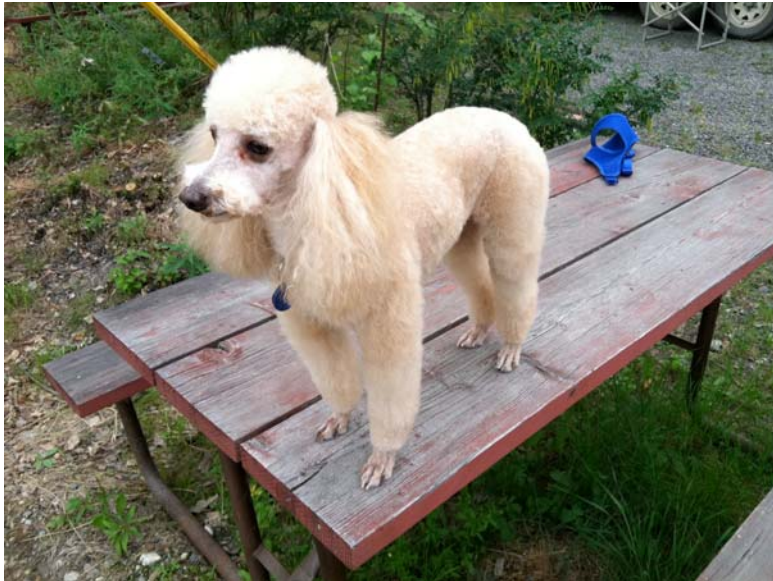
Toby after grooming Fairbanks, AK

We went back to the trailer, took naps, then picked Toby up at 4:00 pm. He looked absolutely outstanding.