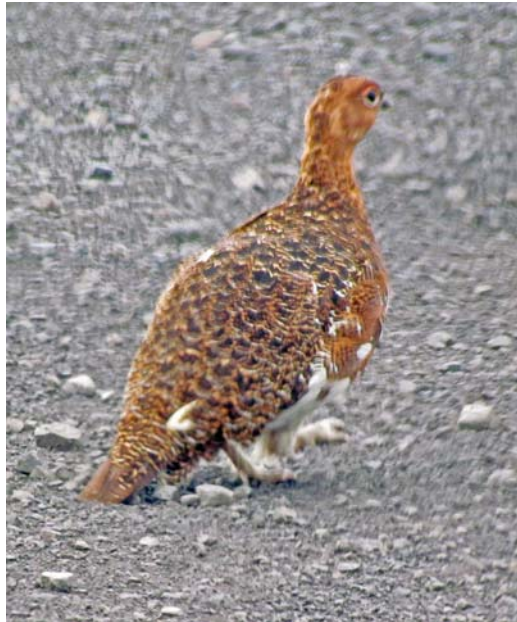
Willow Ptarmigan – male Blackstone Uplands, Dempster Hwy., YK

A bit later I recorded a series of low doublets from a puddly area in the ditch beside the road and thought it might be a frog. (There is a frog up here, the Wood Frog, which I have heard a recording of.) However, when I approached the area a bit, out burst a chicken-like bird with a loud series of alarm calls, which I also recorded. He only flew about 150 ft and settled down poorly concealed in a small willow. I was able to identify it as a male Willow Ptarmigan. Apparently only the male gives those frog-like sounds. [Later: After I got home, I discovered Jim had actually photographed both a male and a female.]