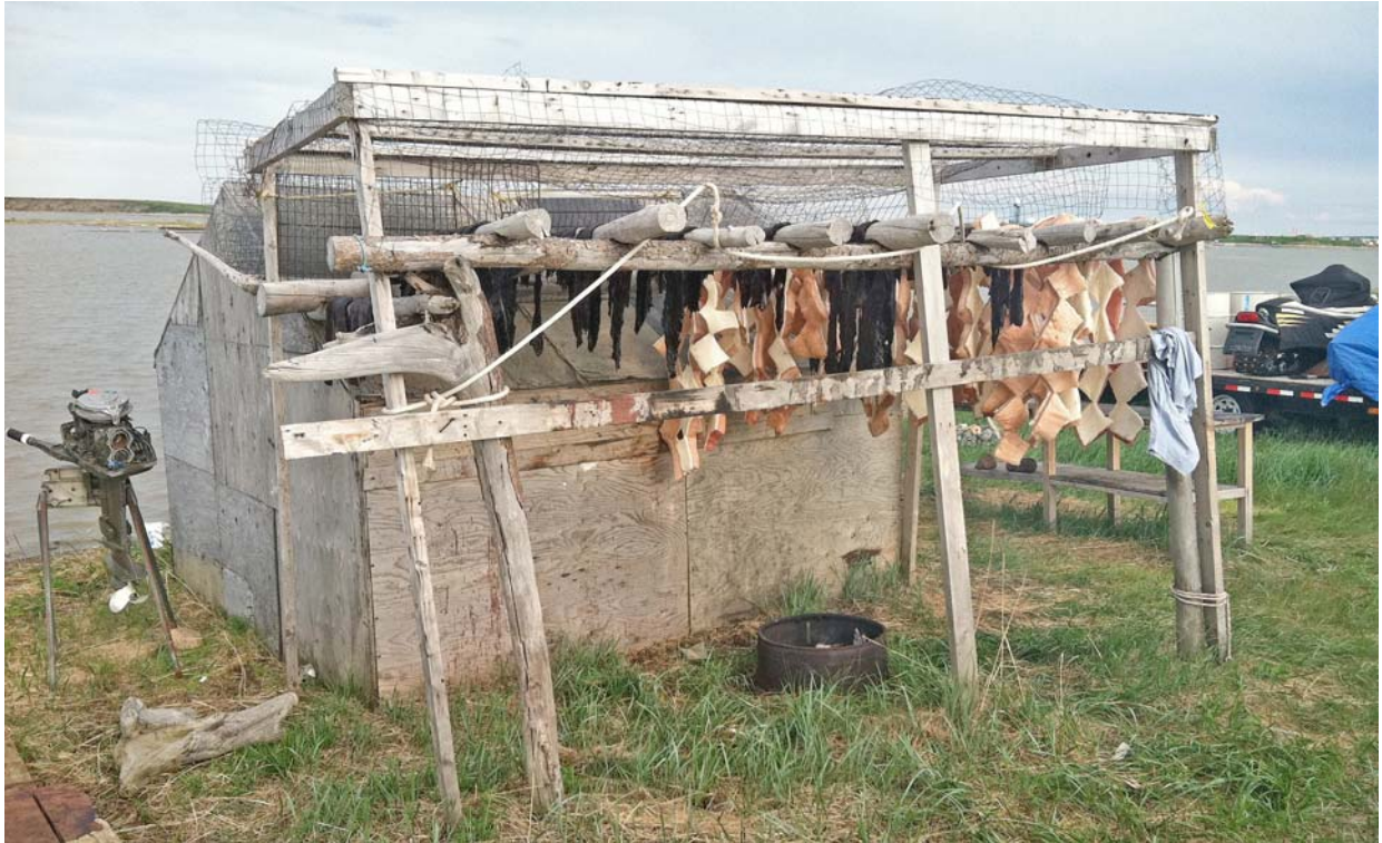
Whale meat on drying rack Tuktoyaktuk, NT

We saw the remains of an old-time sod dwelling with a log framework, whale meat and blubber hanging out to dry an ice house, which merely covers the opening of a pit down into the permafrost.