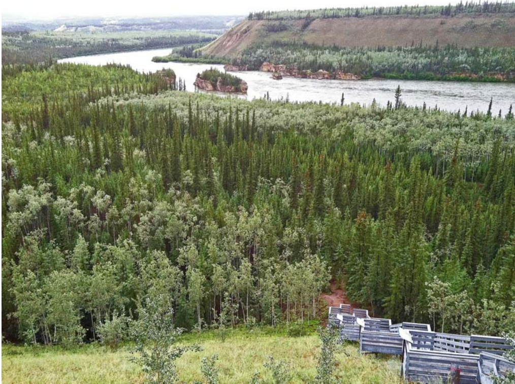
Five-Finger Rapids Klondike Hwy., YK

Campgrounds are few and far between on that road, but we found a "First Nations" (aka Indian) campground in Pelly Crossing after a drive of about 170 miles--more than enough on that road in the rain. The residents of this town originally lived in Ft. Selkirk along the Yukon, then abandoned it for Minto when the road went through. We stayed in a poor campground there last time, but it and the entire town of Minto are now abandoned. So we went on to Pelly Crossing, where the guide book said there is an "informally" (translation: disorganized) laid out campground among the trees. The sites are widely spaced and pretty overgrown, but it's really a nice birding spot the way it is. Intermittent rain kept us from enjoying it to the fullest, but by morning it had pretty well stopped.