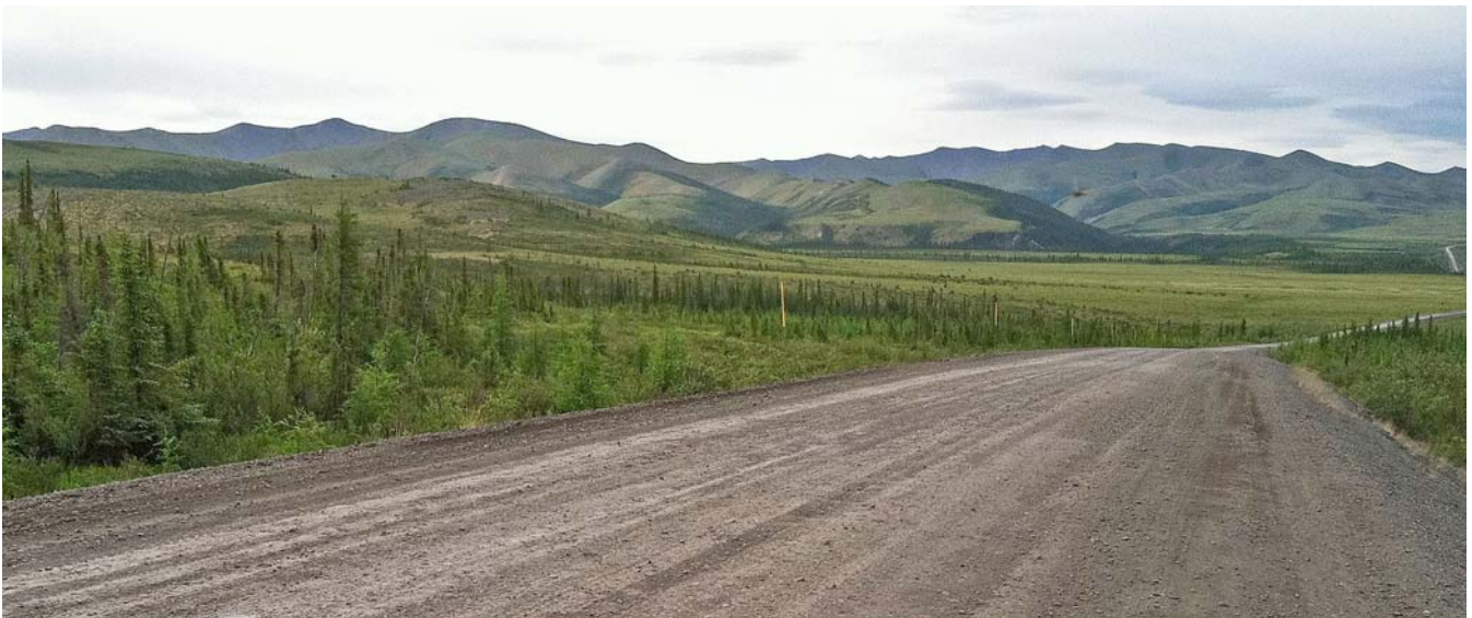
Weather-worn Richardson Mtns. Dempster Hwy., YK