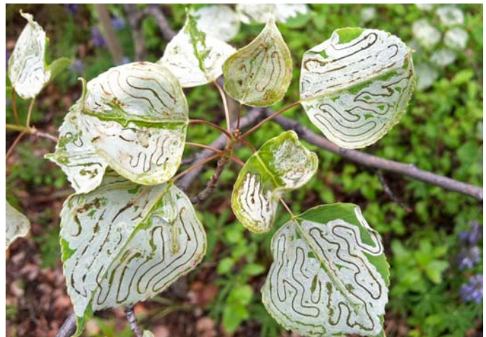
Close-up of aspen leaf with Aspen Serpentine Leafminer Whitehorse, YK