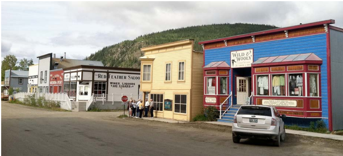
Business district, Dawson City, YK