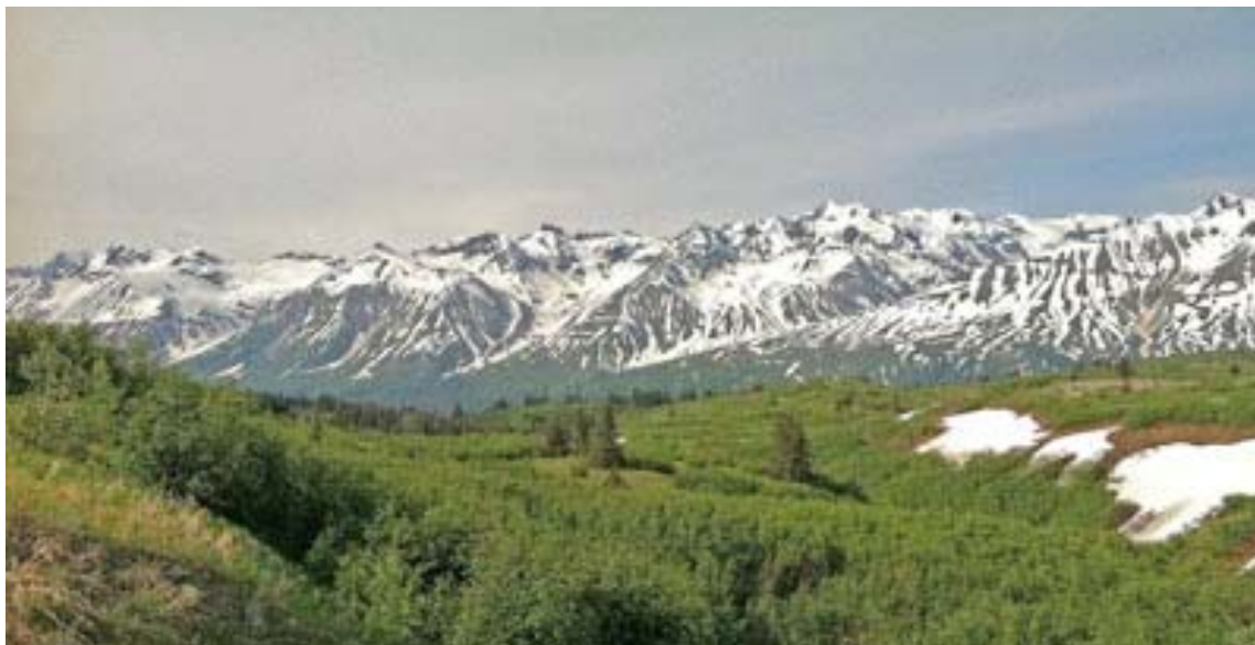
Subalpine habitat Haines Hwy., BC

Yesterday, Friday, June 24, we drove the remaining 62 miles to Haines, stopping many times en route for photos. The weather cooperated perfectly all three days we were on the Haines Hwy.--nearly clear skies and no wind except a little breeze late in the day. As we drove that wonderful road, range after range of glacier-clad mountains came into view. Each view was more stupendous than the one before. Sometimes the foreground was alpine tundra and later on it was subalpine with Mountain Hemlock and Subalpine Fir.