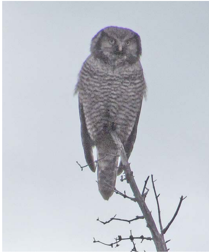
Northern Hawk Owl Dempster Hwy., YK