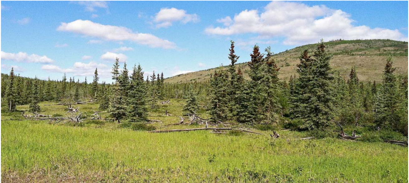
Forest 53 years after fire Between Whitehorse and Haines Junction, YK