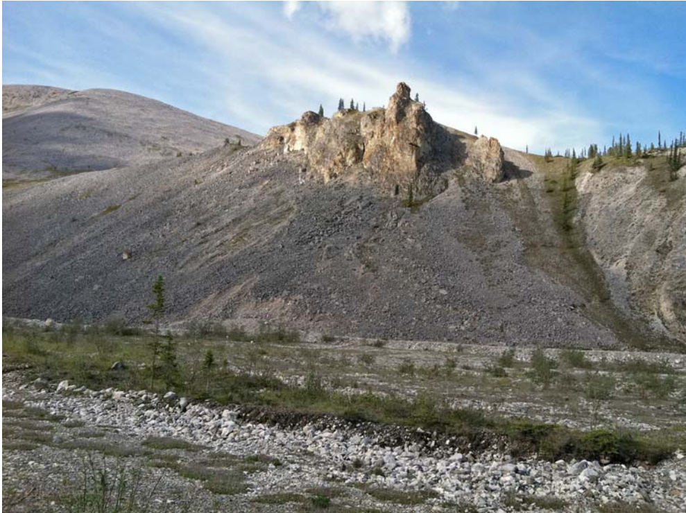
Gryfalcon nesting rock outcropping Near Windy Pass, Dempster Hwy., YK

Since we only planned to drive about thirty miles yesterday, Tues., July 5, we got a late start from our boondocking campsite at the summit of Windy Pass. I fixed Jim some pancakes and then Donelda and I photographed a lot of wildflowers that were growing on the tundra at the pass. When we left, we only drove about three miles downslope to the place where Gyrfalcons sometimes nest. I desperately wanted to see a Gyrfalcon, so we spent quite a lot of time there. The photo shows the rocky outcropping where the books say they "always" nest.