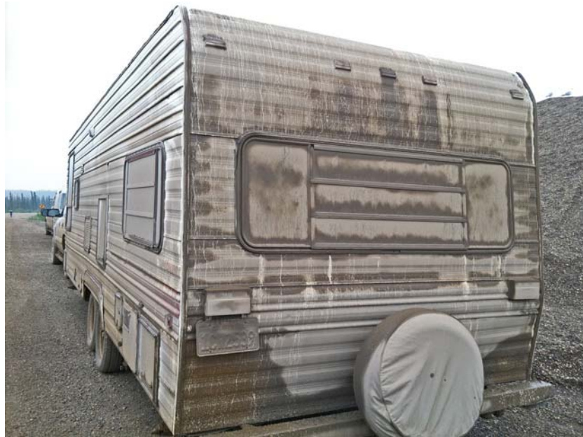
Muddy trailer – rear Near Peel River ferry, Dempster Hwy., NT

When we got here, Jim washed some of the windows so we could see out from the couch and dinette, but left the bedroom ones caked with mud. They'll actually give us a sort of dark room to sleep in tonight for a change. I found it very hard to go to sleep when the sun was streaming in the window, but most nights in Inuvik it got cloudy in the evening--sort of like the marine layer at home. This cloudiness usually lasted well into the morning and even early afternoon. That's why they schedule their tours for late afternoon and evening.