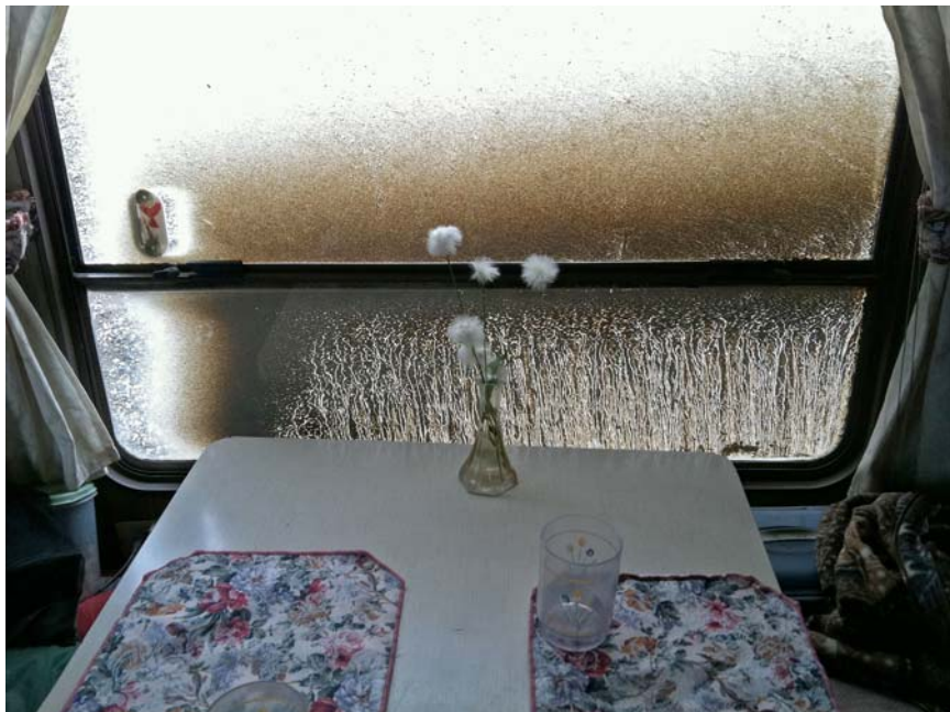
Muddy trailer – dinette from inside Near Peel River ferry, Dempster Hwy., NT