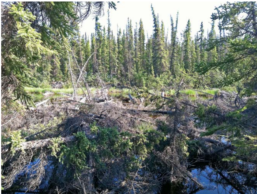
Thermokarst pond Pine Lake Territorial Park, near Haines Junction, YK

After I wrote up yesterday's installment, I walked the nature trail that started in the day-use area and passed right behind our site and ran along the lakeshore. The most interesting place on the trail was what was termed a "thermokarst," a boggy pond with dying spruce trees tilted at various angles and fallen across one another into the pond in a tangle.