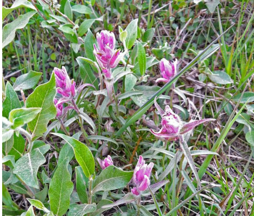
Elegant Paintbrush, Castilleja elegans Tuktoyaktuk, NT

I also improved on my photos of the exquisite lavender Elegant Paintbrush and Labrador Tea.