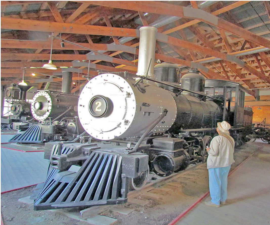
Gold-rush era trains Museum, Dawson City, YK

(The fourth one was sold to White Pass and Yukon RR, then to a succession of other buyers, and now sits in storage in Oklahoma.)