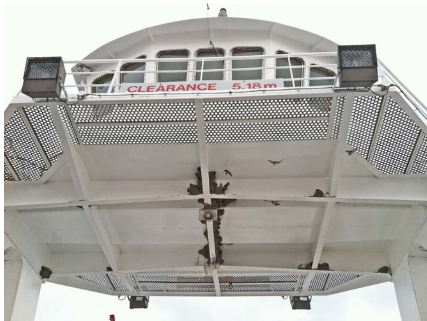
Cliff Swallows and nests on MacKenzie River ferry Dempster Hwy., NT

As we were on the ferry, we kept noticing Cliff Swallows circling around the boat and finally looked over our heads and discovered they had a nesting colony underneath the superstructure of the ferry. A ferry employee told us that they started doing this two years ago with only a couple of nests. Last year there were more and this year more yet. The birds just fly along with the boat and chase bugs over the water. It apparently works well for them. At first the captain wanted to wash the nests down, but since they've proven to be so popular with the tourists, he decided to leave them.