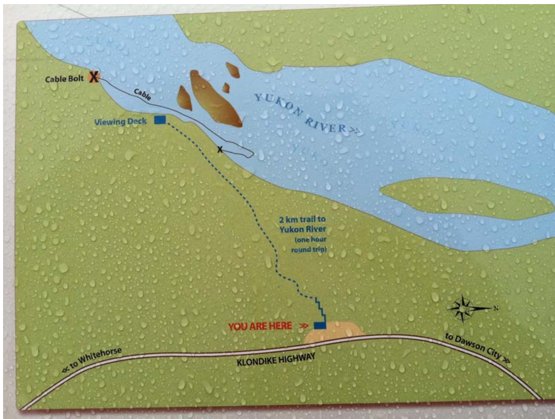
Five-Finger Rapids – map on sign Klondike Hwy., UK

The rapids overlook is high above the river, but there is a set of 219 stairs (according to the sign, not our count) and a trail through the forest to a closer view of the area. Donelda had wanted to take it, but she twisted her knee the other day. She said the stairs were not a big problem, but the trail afterwards had lots of protruding roots that were difficult to step over without twisting her knee, so she turned back. I took lots of photos of the signs explaining the place.