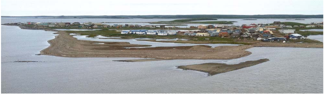
Tuktoyaktuk From plane, NT

Our first stop after leaving the airport in Tuk was at a pingo. (I had photographed a few from the plane.)