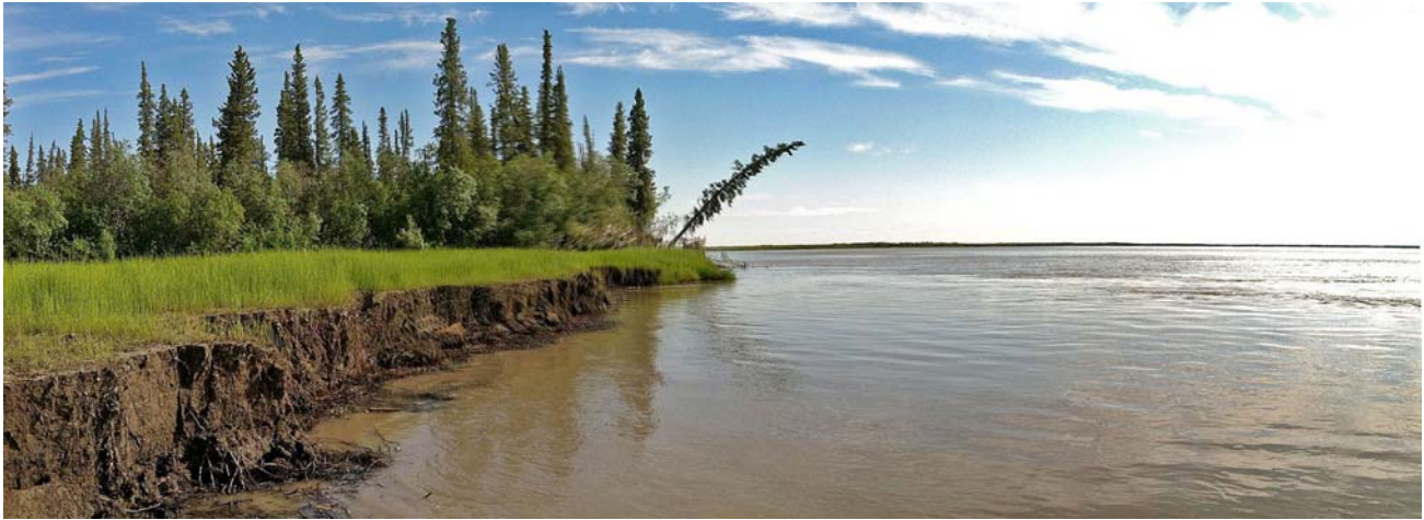
Tilted tree on receding bank MacKenzie River delta, NT

We actually watched the bank crumble off in one place. Kyle told us that it is normal for banks to crumble on one side and build up with mud flats on the other, but that the process is going much faster than it should due to global warming melting the permafrost, which stabilizes the ground.