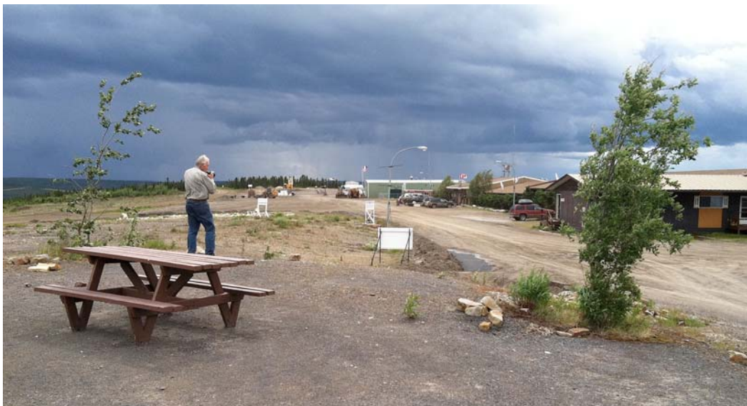
Eagle Plains Hotel complex and departing storm Dempster Hwy., YK