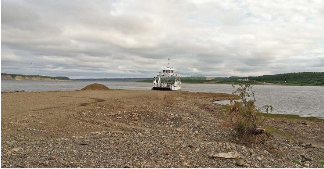
MacKenzie River and ferry Dempster Hwy., NT

As we were on the ferry, we kept noticing Cliff Swallows circling around the boat and finally looked over our heads and discovered they had a nesting colony underneath the superstructure of the ferry. A ferry employee told us that they started doing this two years ago with only a couple of nests. Last year there were more and this year more yet. The birds just fly along with the boat and chase bugs over the water. It apparently works well for them. At first the captain wanted to wash the nests down, but since they've proven to be so popular with the tourists, he decided to leave them.