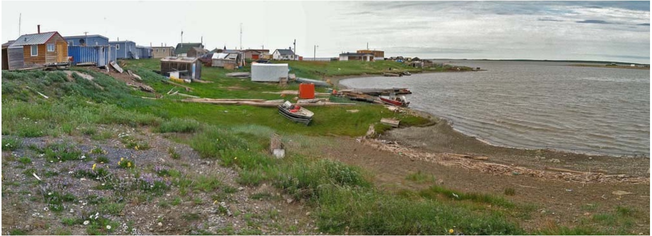
Shoreline buildings Tuktoyaktuk, NT