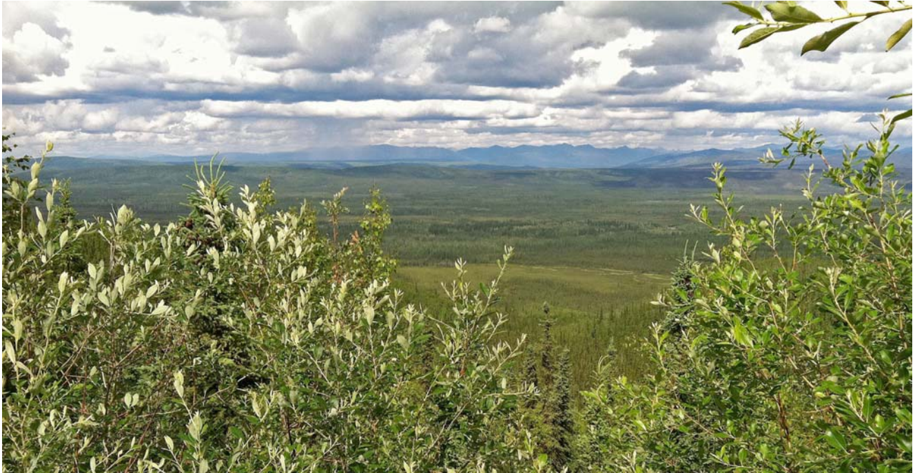
Tintina Trench From Klondike Hwy., YK

Somewhat farther along we found a high overlook of the Tintina Trench valley and signs explaining it more fully. It's a strike-slip fault which runs diagonally from southeast to northwest, with the southwestern side moving north with respect to the northeastern one--sort of like our San Andreas. Today major river systems, including the Yukon and the Klondike, flow along this fault. The gold in this area was all concentrated and churned to the surface by geologic action along this fault. Wonderfully informative signs and maps at the overlook explained in detail how seismic action and ice dams during the Pleistocene have dramatically changed the course of rivers in the area. I took photos of all the signs.