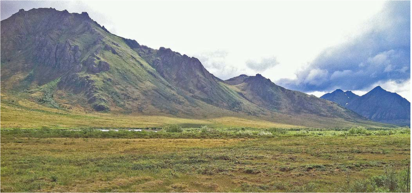
Glacier-carved Ogilvie Mts. Blackstone Uplands, Dempster Hwy., YK