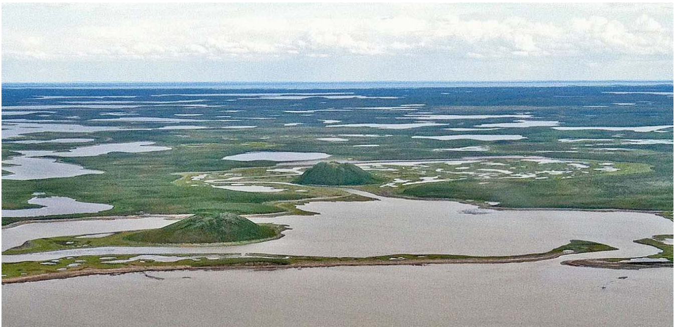
Pingos From plane near Tuktoyaktuk, NT