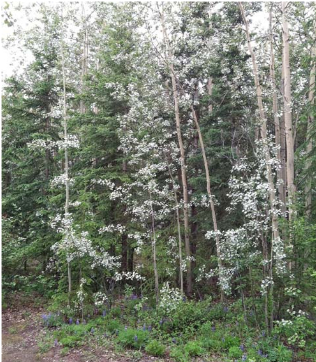
Aspens infested with Aspen Serpentine Leafminer Whitehorse, YK

All along the road starting on the northern part of the Cassiar we've been noticing a whitish cast to the aspen leaves. I thought for a while we had gotten into another species of deciduous tree, but when we got to Whitehorse and looked carefully at the leaves, we could see that they were covered with narrow brown lines <1 mm wide surrounded on both sides by a white deposit maybe 3 mm on each side. These wormy things are 4-6 cm long and curl all over the surface of the leaf, with several on each one. I took pictures.