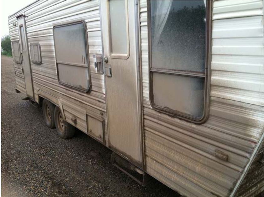
Muddy trailer – dinette side Near Peel River ferry, Dempster Hwy., NT

Our trucks and trailers are an even worse muddy mess than ever. When we stopped for lunch, we couldn't see out at all, but that was OK for we were parked right next to a gravel pile just up from the 2nd ferry.