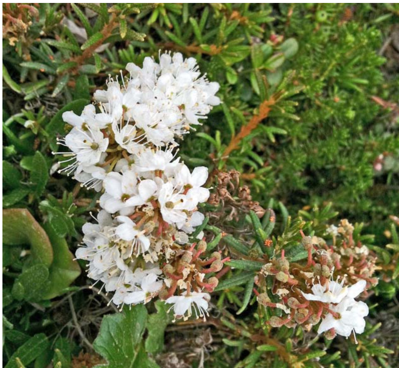
Northern Labrador Tea, Ledum palustre Tuktoyaktuk, NT