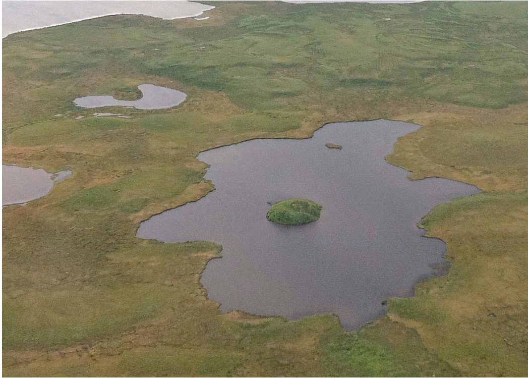
Pingos (detail of preceding picture) from plane near Tuktoyaktuk, NT