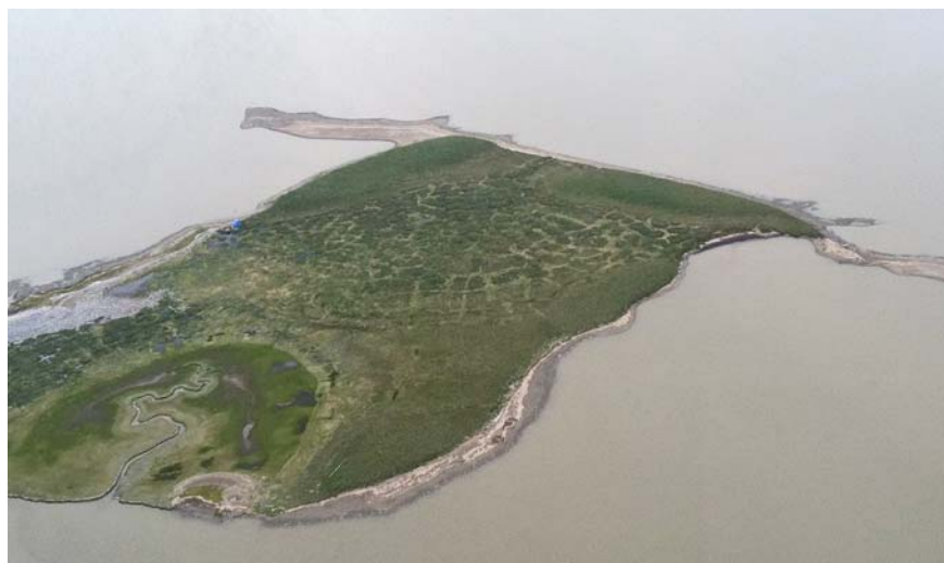
Polygons in tundra From plane to Tuktoyaktuk, NT