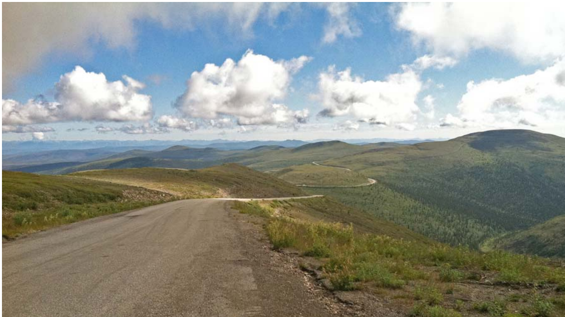
Highway through tundra Top of the World Highway, YK

The Top of the World portion of the drive was exceedingly scenic. We really felt on the top of the world for the road runs along a high tundra-clad ridge with spectacular distant views in all directions. I took full advantage of the first clear day in a long time and took lots of photos.