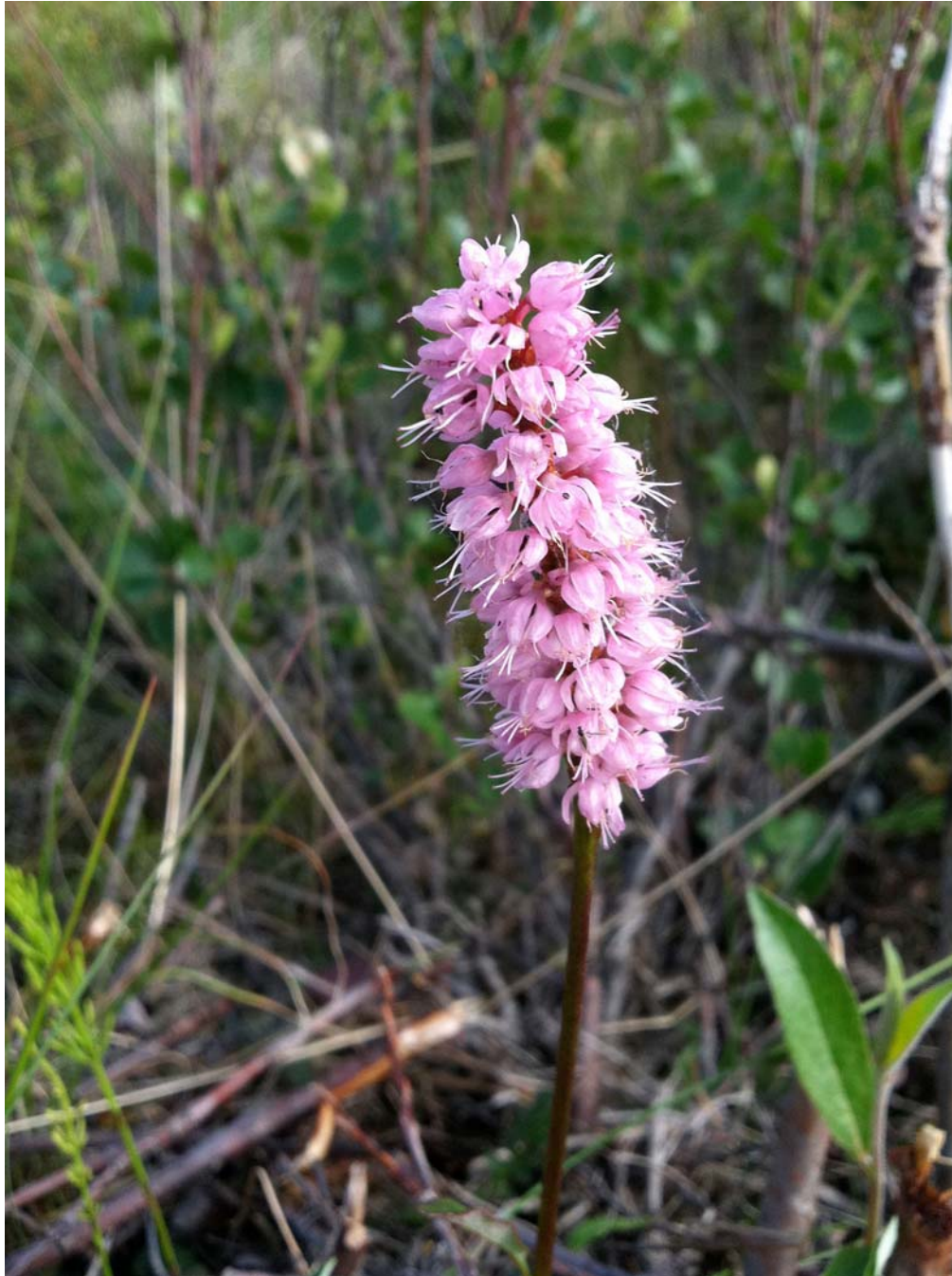
Bistort, Polygonum bistorta Windy Pass, Dempster Hwy., YK