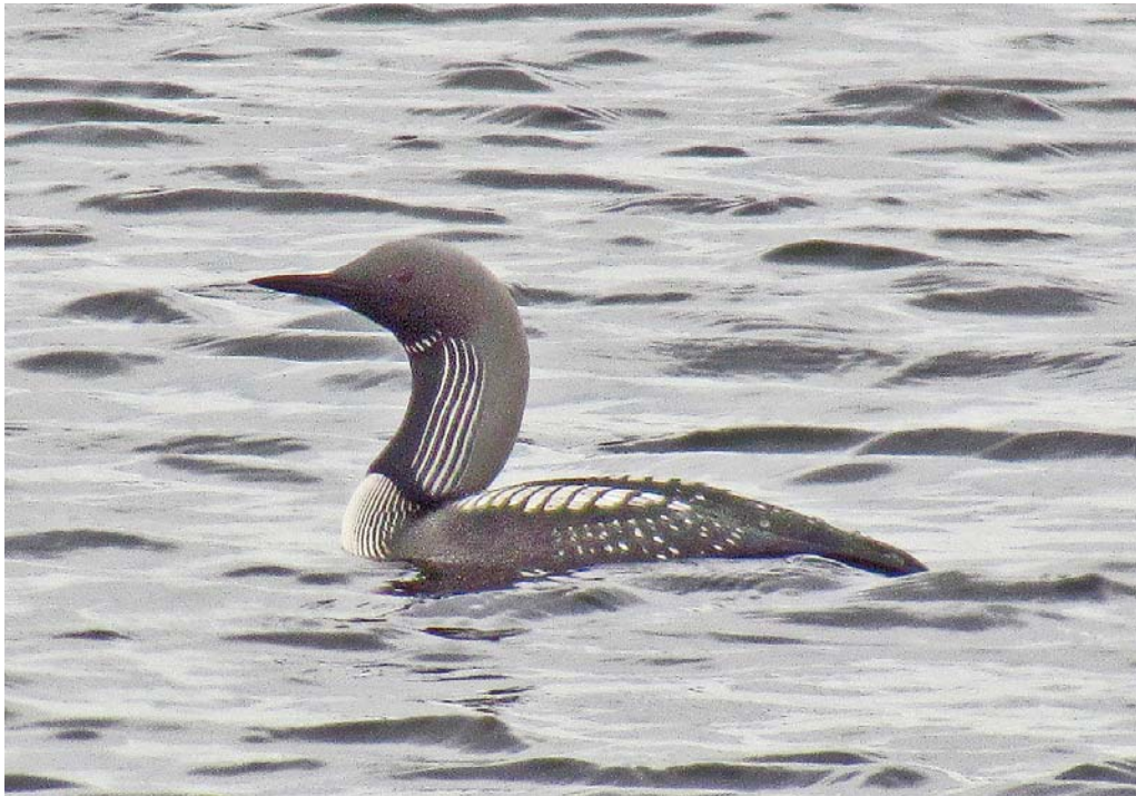
Pacific Loon Peel Plateau, Dempster Hwy., NT