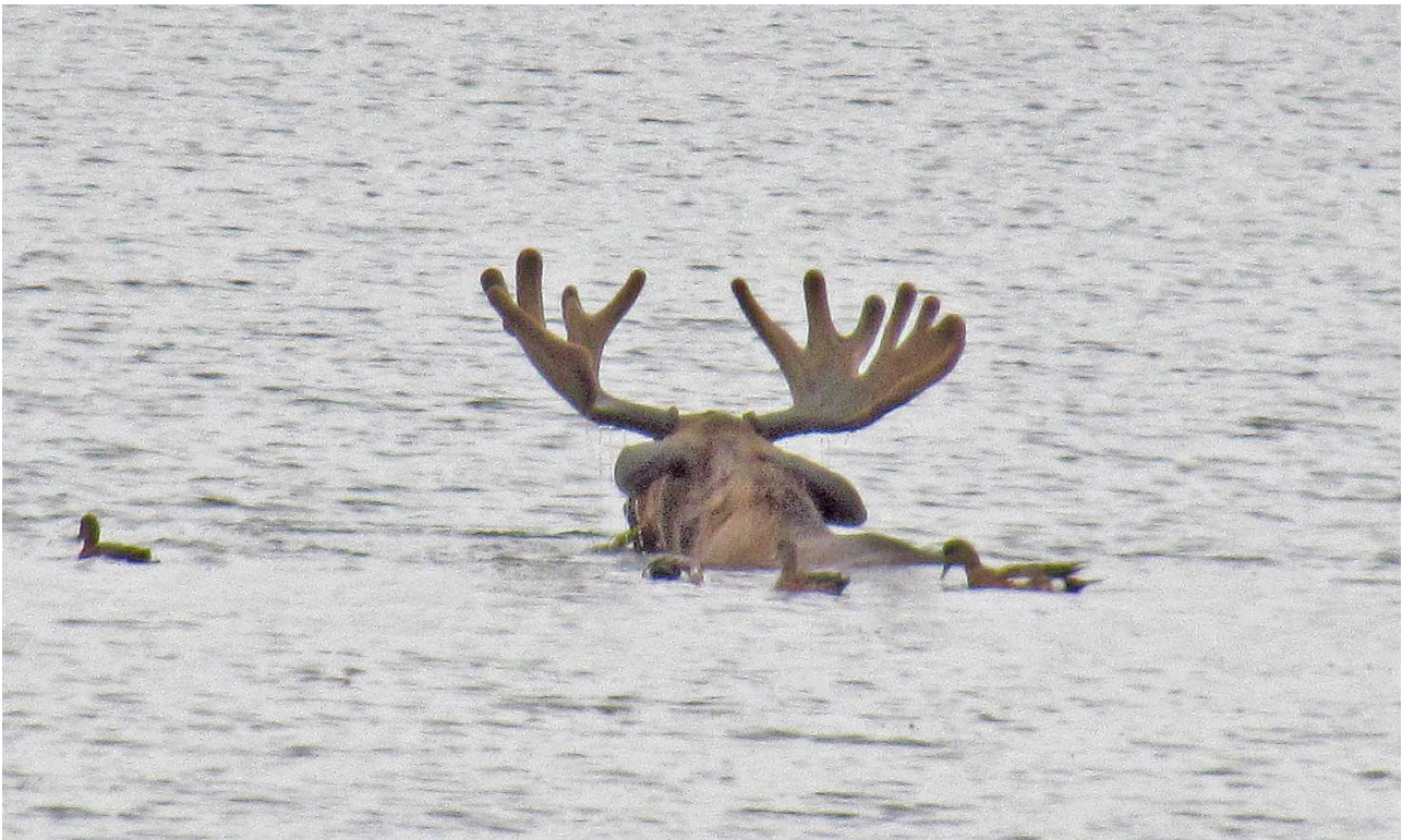
Moose and American Wigeons Two-Moose Lake, Dempster Hwy., YK

We continued on northward, stopping occasionally to listen, too, but found nothing of interest, probably because it was cold and raining lightly most of the time. We were in the Blackstone Uplands, perhaps the richest place on the entire Dempster for breeding birds, making the day especially disappointing. Twenty years ago this place was wonderful. We were prepared to drive another 50 miles, but lucked out and found a wide pull-out at the top of Windy Pass, just three miles short of the steep cliffs where Gyrfalcons usually nest--but not this year and not in 1991 when we were here before. Still the birds might be around, so we'll spend a good bit of time looking for them when we pass by that area tomorrow. I recall that last time I walked the entire steep-cliffed area and maybe I'll do it again--if it doesn't rain!