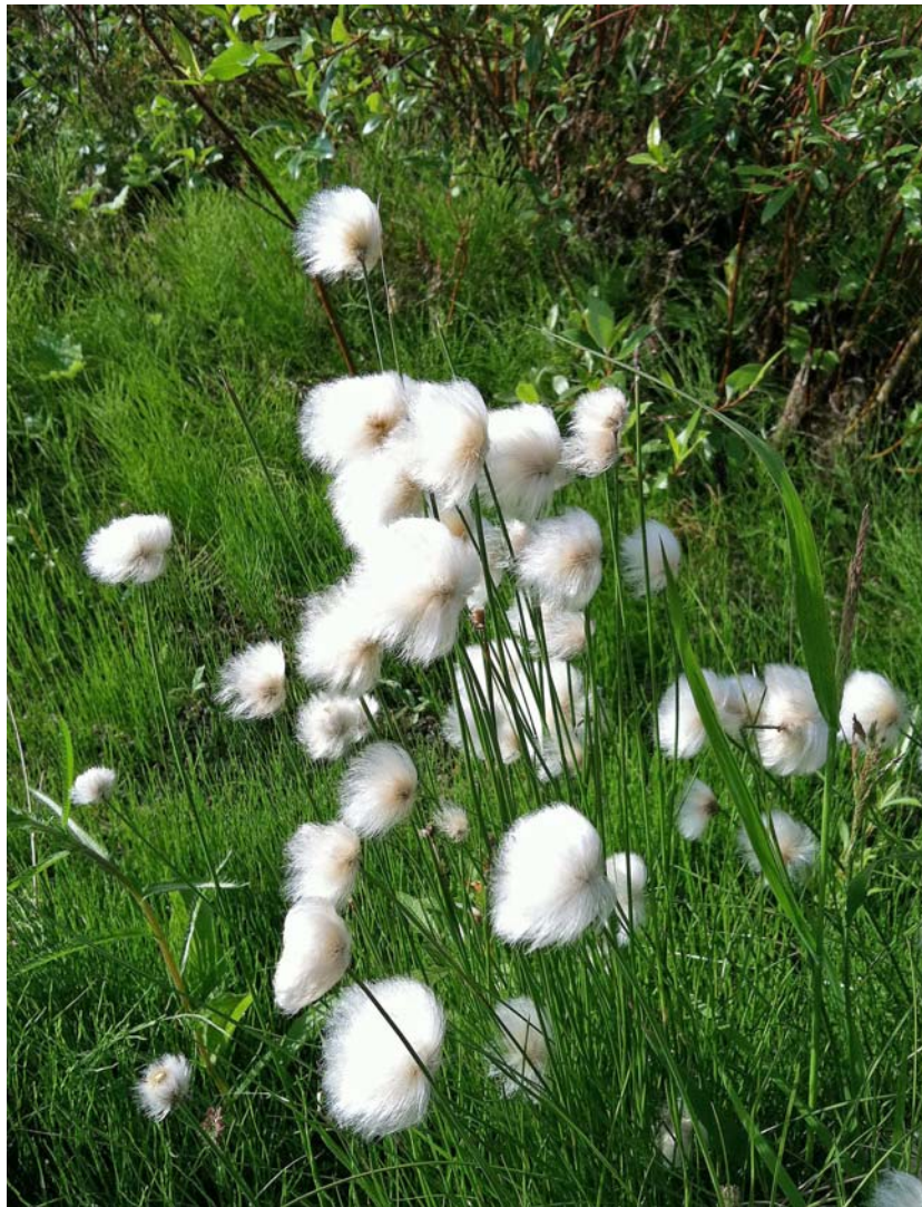
Tall Cotton Grass, Eriophorum scheuchzeri Dempster Hwy, NT

Friday, July 8, we drove a fairly short distance through the Richardson Mountains. We stopped a number of places and tried to call out a Northern Wheatear with a recording, but without success. I also photographed one of my favorite Arctic plants, Tall Cotton Grass, growing in a roadside ditch.