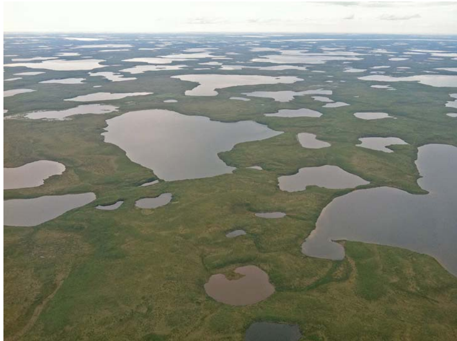
MacKenzie River delta from plane to Tuktoyaktuk, NT

that MacKenzie River delta laid out below us. What an intricate labyrinth of channels, lakes, ponds, etc. At first there were lots of spruce trees, but gradually they petered out into just tundra. I was especially looking for the huge polygons produced by repeated freezing and thawing of the permafrost. I did find some small areas of it and got some nice photos. In fact, I really went wild photographing everything out the window, including the town of Inuvik. I found if I aimed right, I could get a full-frame shot under the wing, but over the tire--and if I was really careful could even get my horizon straight.