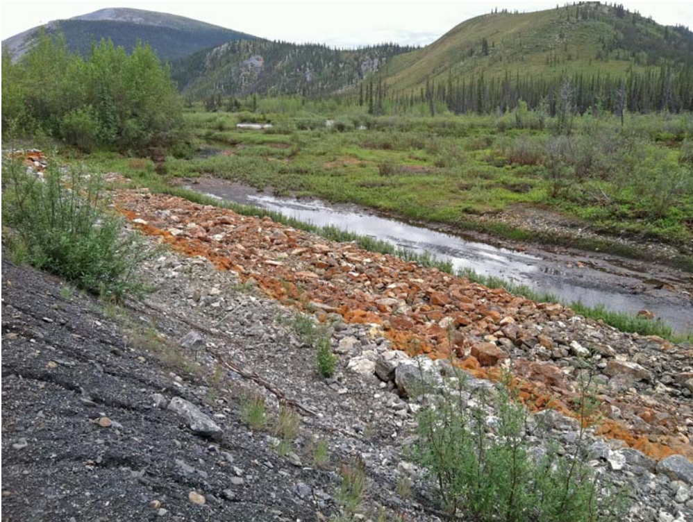
Red Creek Dempster Hwy., YK

chemistry when I get home and try to figure out what it is. The reddest rocks were closest to the creek where they'd get splashed by high water. The grayish ones were higher up, so the red ones are probably gray underneath a coating. [Later: The two rocks are right beside the walkway to our front door.]