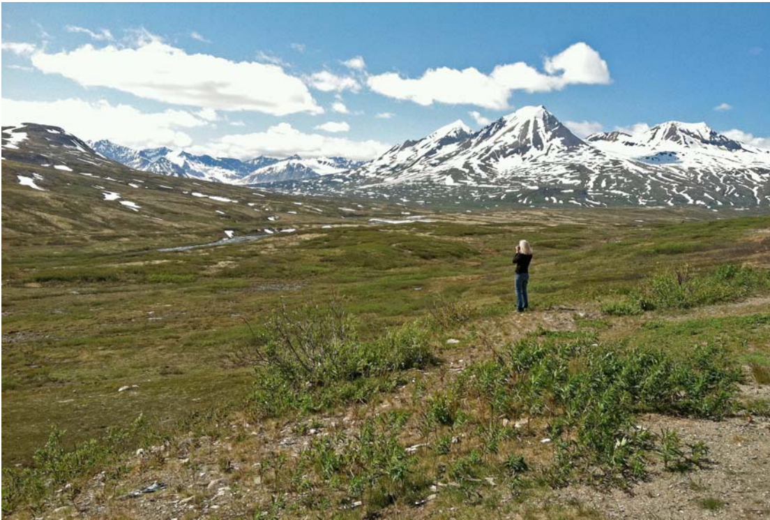
From Chuck Creek trailhead campsite Near summit, Haines Hwy., BC

We roamed around that area all afternoon that day and all morning the next and began to see little microhabitats, based on the fact that certain birds were only found in certain areas.