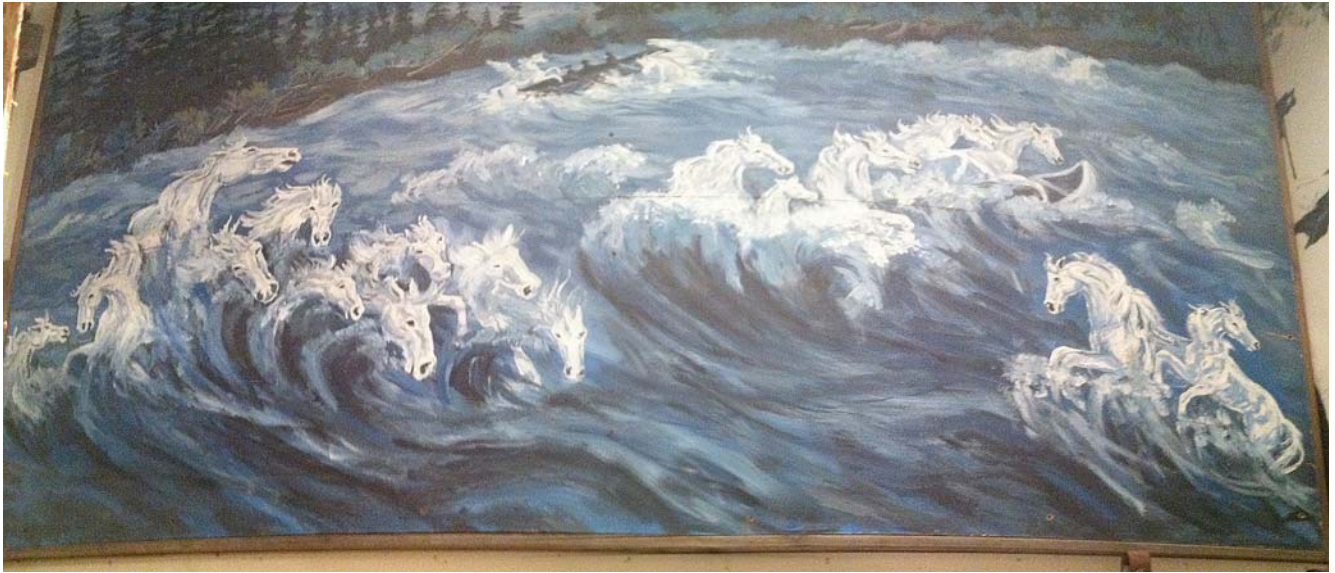
Painting: Whitehorse Rapids & imagined wild horses MacBride Museum of Yukon History, Whitehorse, YK

Now the rapids are part of a reservoir behind a dam. You can look at the canyon, but not the rapids.