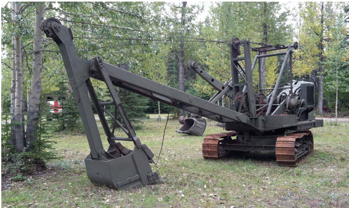
Old Alaska Hwy. road-building equipment Discovery Yukon RV Park, Alaska Hwy, YK, near Alaska border

I selected this full-hookup park because the guide book mentioned the large collection of 1940s equipment on the grounds. This park was actually a small army post during the road-building period. There's even an airstrip out back. The part from which the planes actually take off and land isn't right there, but the grassy strip beyond the runway is. We saw (and heard) a couple of planes and one helicopter take off. I really enjoyed wandering the grounds and looking at the old US Army vehicles here on Canadian soil--trucks, back-hoes, ambulance, and an old filling station from the immediate post-war period when the road became public.