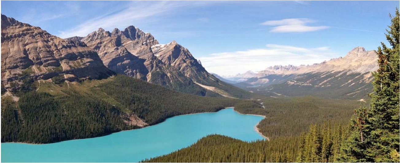
Peyto Lake – panorama Banff National Park, AB