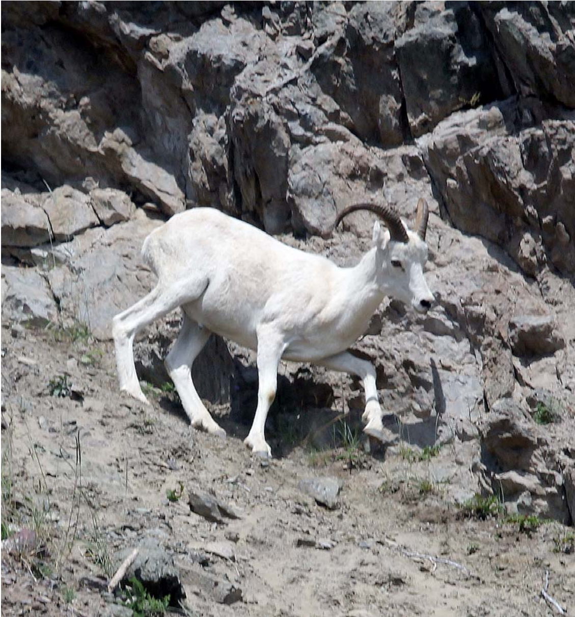
Thin-horned ("Dall") Sheep Beside Turnagain Arm south of Anchorage, AK