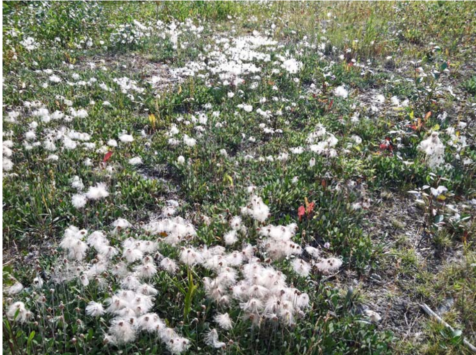
Cotton Grass overview, probably Eriophorum chamissonis Alaska Hwy. west of Muncho Lake Provincial Park, BC

Loving Cotton Grass as I do, I was interested to discover a different species in this area from that I'd seen in the Arctic. This one grows in drier ditches and is not pure white, but still impressive.