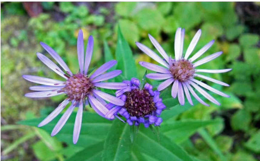
Great Northern Aster Aster modestus Liard Hot Springs Provincial Park, BC