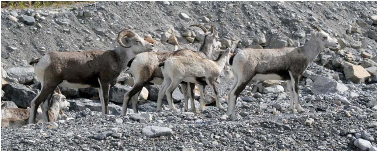
Thin-horned ("Stone") Sheep – male, female and juveniles Muncho Lake Provincial Park, BC