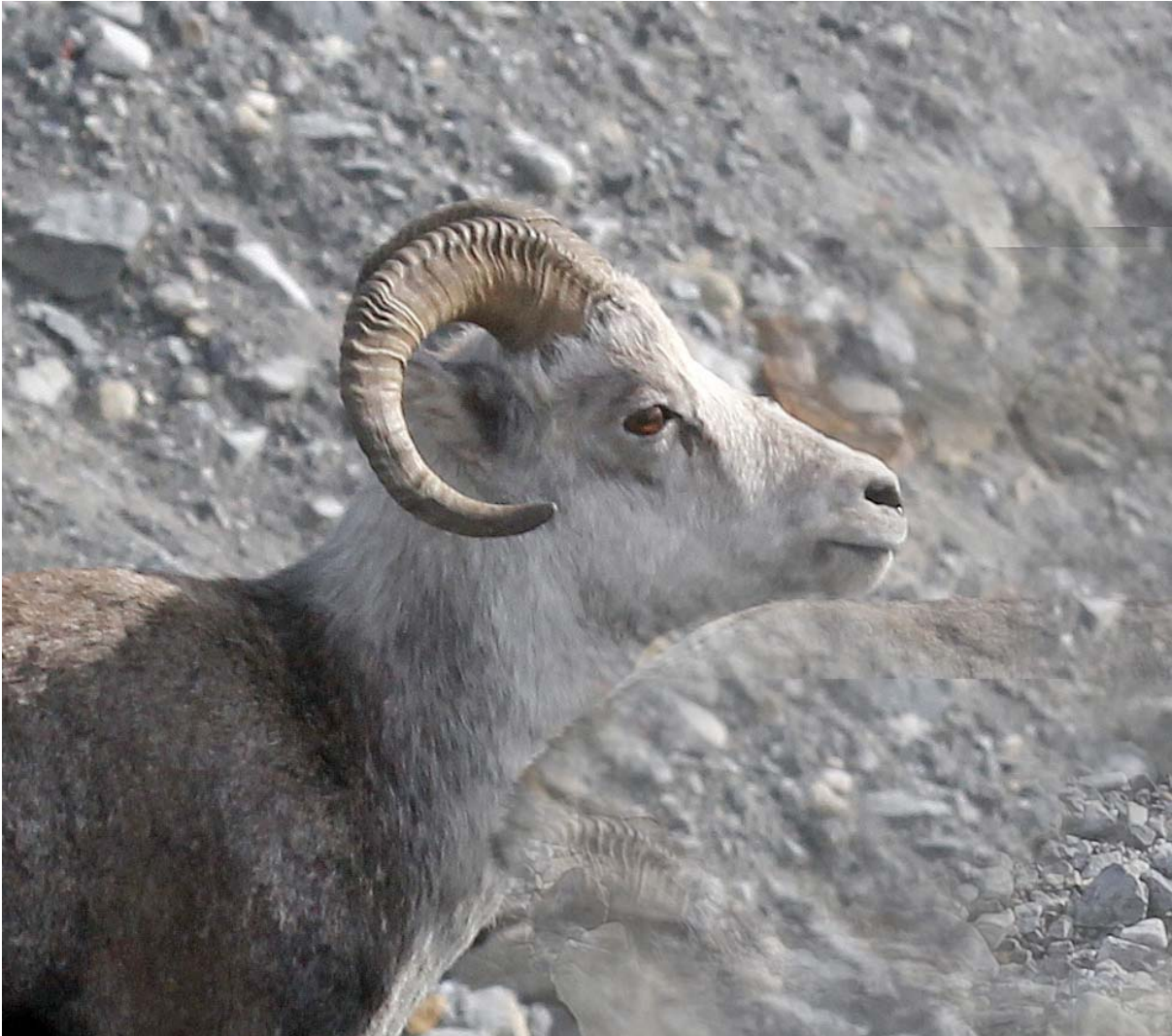
Thin-horned ("Stone") Sheep – male Muncho Lake Provincial Park, BC