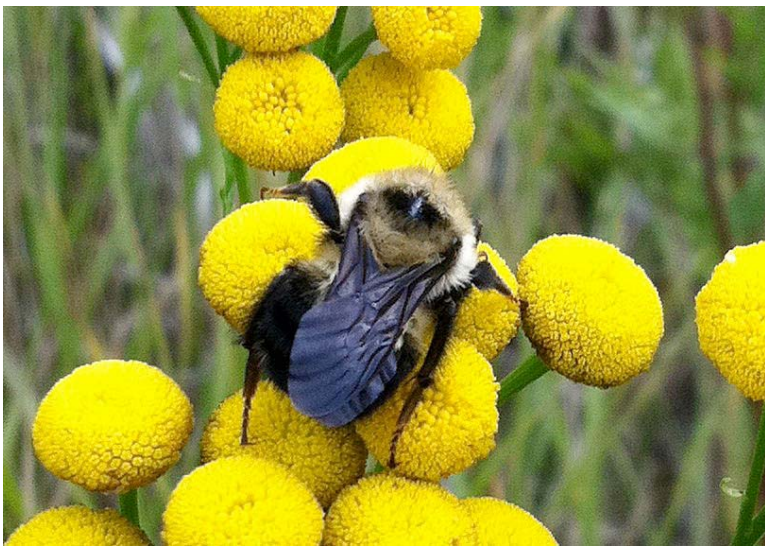
Two-spotted Bumblebee, Bombus bimaculatus ; on Common Tansy, probably Tanacetum vulgare Moonshine Lake Provincial Park, AB

Jim didn't get any pictures at the pond, but I decided to photograph a few flowers on the way back, although I was pretty sure they were weedy aliens. One of them was probably introduced Common Tansy, Tanacetum vulgare , but the other was a widespread native, Canada Thistle, Cirsium arvense . As I was photographing the flowers, I discovered that each one had a different species of bee on it. Even though they were swaying in the wind and difficult to get my iPhone to focus on, I got as close as possible to them and was thrilled to discover that I had first-rate shots of both bees--not first-rate for an iPhone, but first-rate period ; even the tiny hairs on them show crisply and I had to crop the images quite a bit. One of them was Two-spotted Bumblebee, Bombus bimaculatus . The other I couldn't find in Kaufman's Insects book, but I'm pretty sure it's in the family Megachilidae. I'll have to try to pin it down when I have internet access.