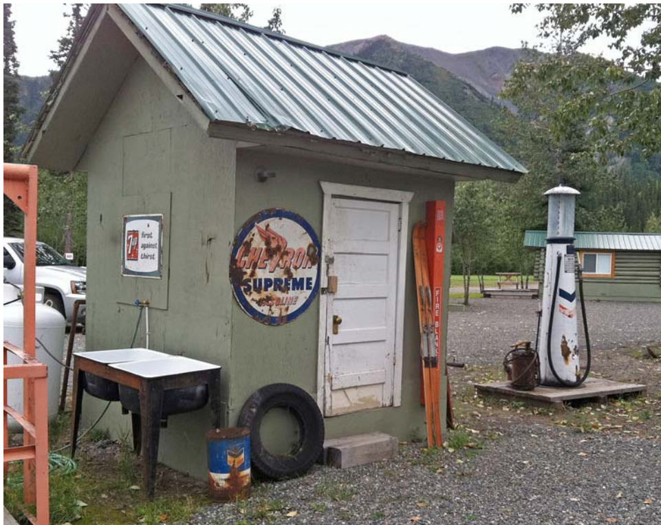
Post-World-War-II filling station Discovery Yukon RV Park, Alaska Hwy., YK, near Alaska border