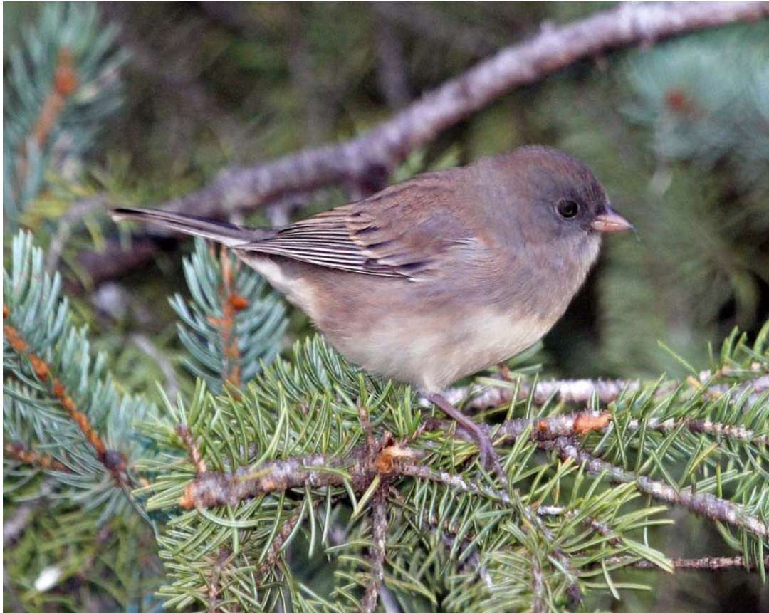
Dark-eyed Junco (Oregon/Slate-colored intergrade?) Moonshine Lake Provincial Park, AB

Juncos that look like intergrades between Slate-colored and Oregon, but more Slate-colored, are also present.