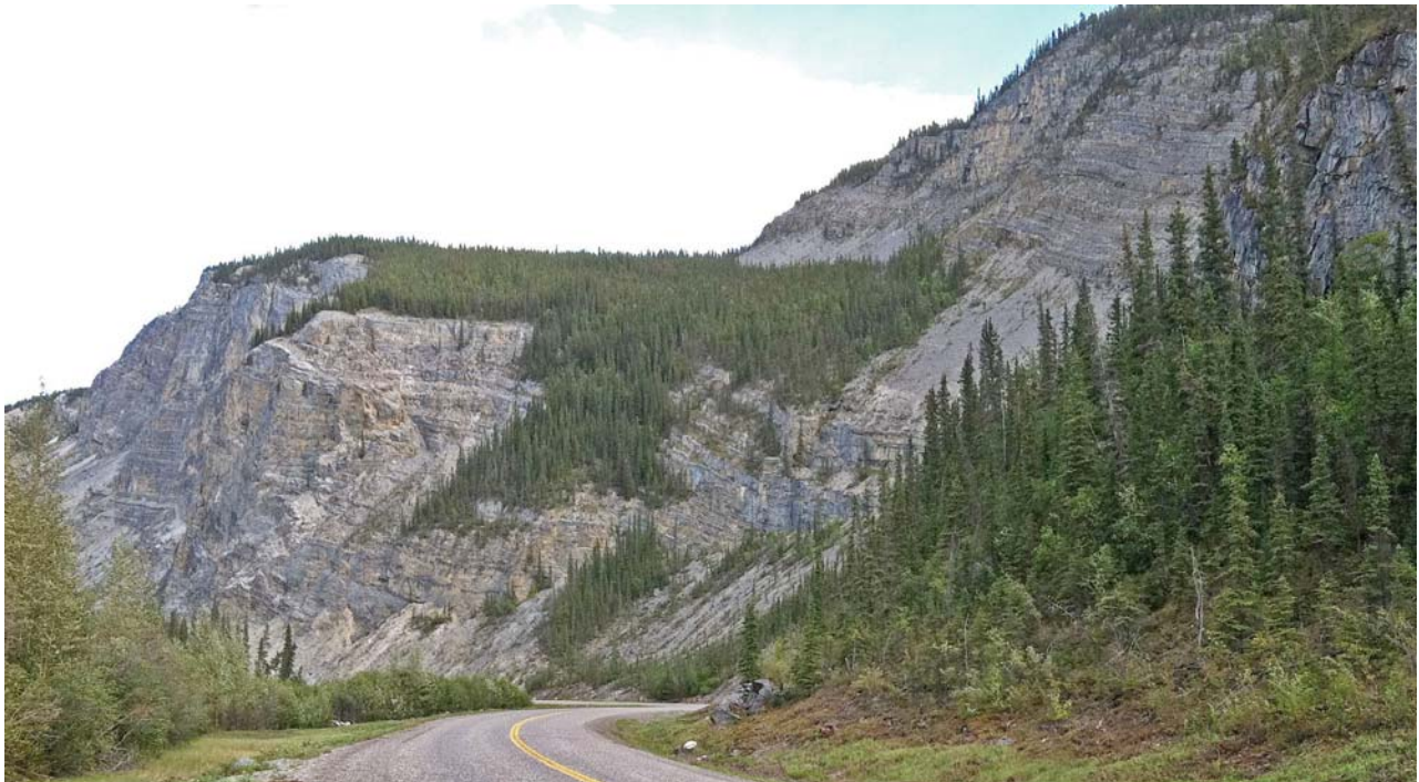
Contorted rock layers Alaska Hwy, through northern Rocky Mountains, BC

Soon after that we reached the true Rocky Mountains, with their uptilted sedimentary rocks--just like Colorado, though not so high. They were created after the coastal mountains when the west-moving North American plate and the east-moving Pacific Plate forced the continent to buckle in the middle along an apparent weak strip. It was easy to see the curves and broken lines of sediments in the cliff faces. Unfortunately there were very few places to stop and photograph the effects, but I got some pictures.