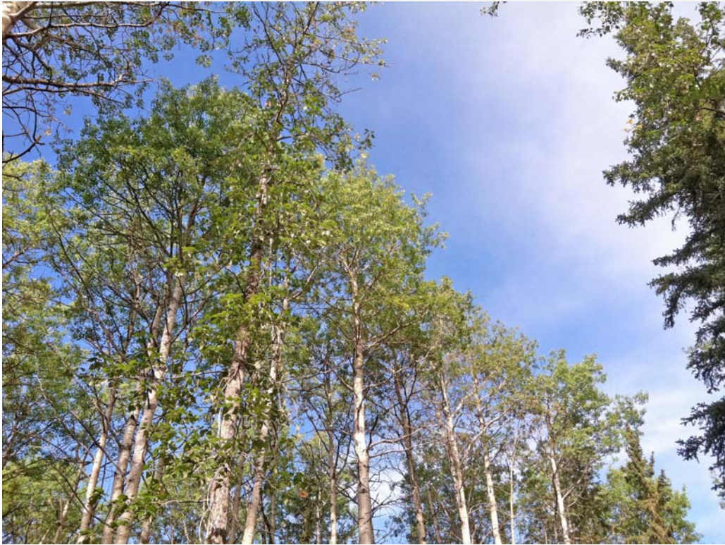
Aspen and spruce tree tops Moonshine Lake Provincial Park, AB