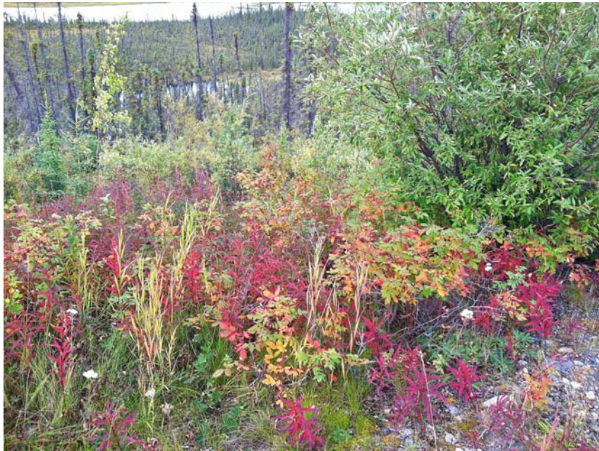
Prickly rose and giant Fireweed in fall color Alaska Hwy., YK, near Alaska border

Crossing the border into Canada was easy this time, so we've had two unpleasant experiences followed by two easy ones on this trip. However, after we entered Yukon, the road became annoyingly slow with really deep frost heaves and lots of broken pavement. Much of this damage was difficult to see coming, so we finally settled on 40-45 mph and hoped for the best. En route we stopped for lunch at a roadside rest which offered a short nature trail through some beautiful fall-colored Prickly Rose and Giant Fireweed.