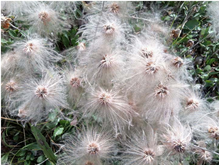
Cotton Grass close-up, probably Eriophorum chamissonis Alaska Hwy. west of Muncho Lake Provincial Park, BC