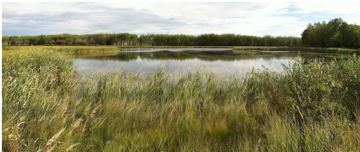
Jack Bird Pond Moonshine Lake Provincial Park, AB

This morning, Sun., Sept. 4, we took a short drive to Jack Bird Pond, also part of the park. We wouldn't have had any idea it was there if I hadn't had a chat with the camp host; he told me about it. To get there we returned to the main highway entrance to the park on Road 725, drove south one-half mile to a dirt road across from a farm complex on the right. We turned left (east) on that road and drove one mile, where the road made a right-angle bend to the right. After about one-half mile on that road, we found a sign that directed us to turn left into the park. (That was the only sign there was.) A short drive took us to a little turn-around with rest-rooms, picnic tables, and a grassy trail that went part-way around the pond.