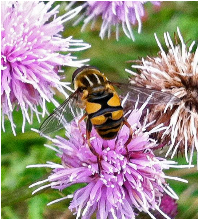
Bee (probably Megachilidae family) on Canada thistle, cirsium arvense Moonshine Lake Provincial Park, AB

[Later: I never figured it out to the species.]