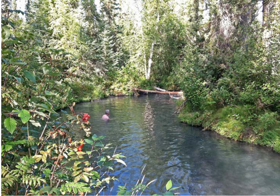
Stream below bathing pool Liard Hot Springs Provincial Park, BC

This is reached via a 600-meter boardwalk.