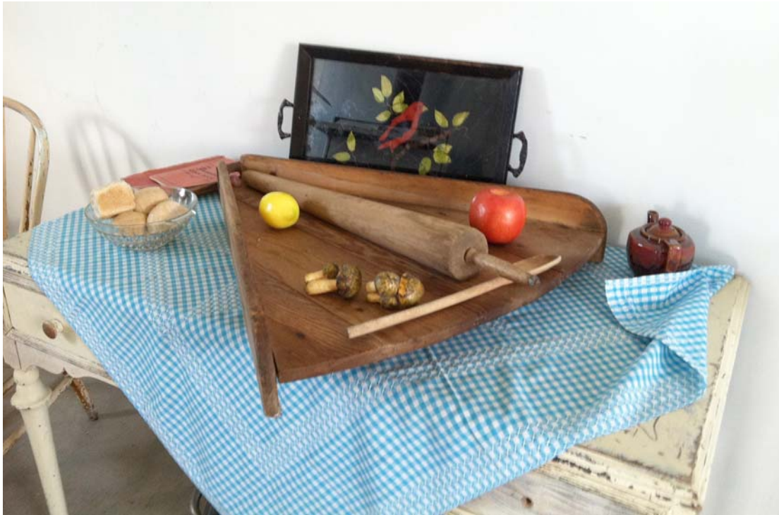
Unknown kitchen device Pioneer Village, Dawson Creek, BC

No one in the office could tell me what it was for, nor could anyone in the Visitors Center museum the next day. In the latter location, the woman even searched the internet for ideas. Her best guess was that it was some sort of fruit crusher.