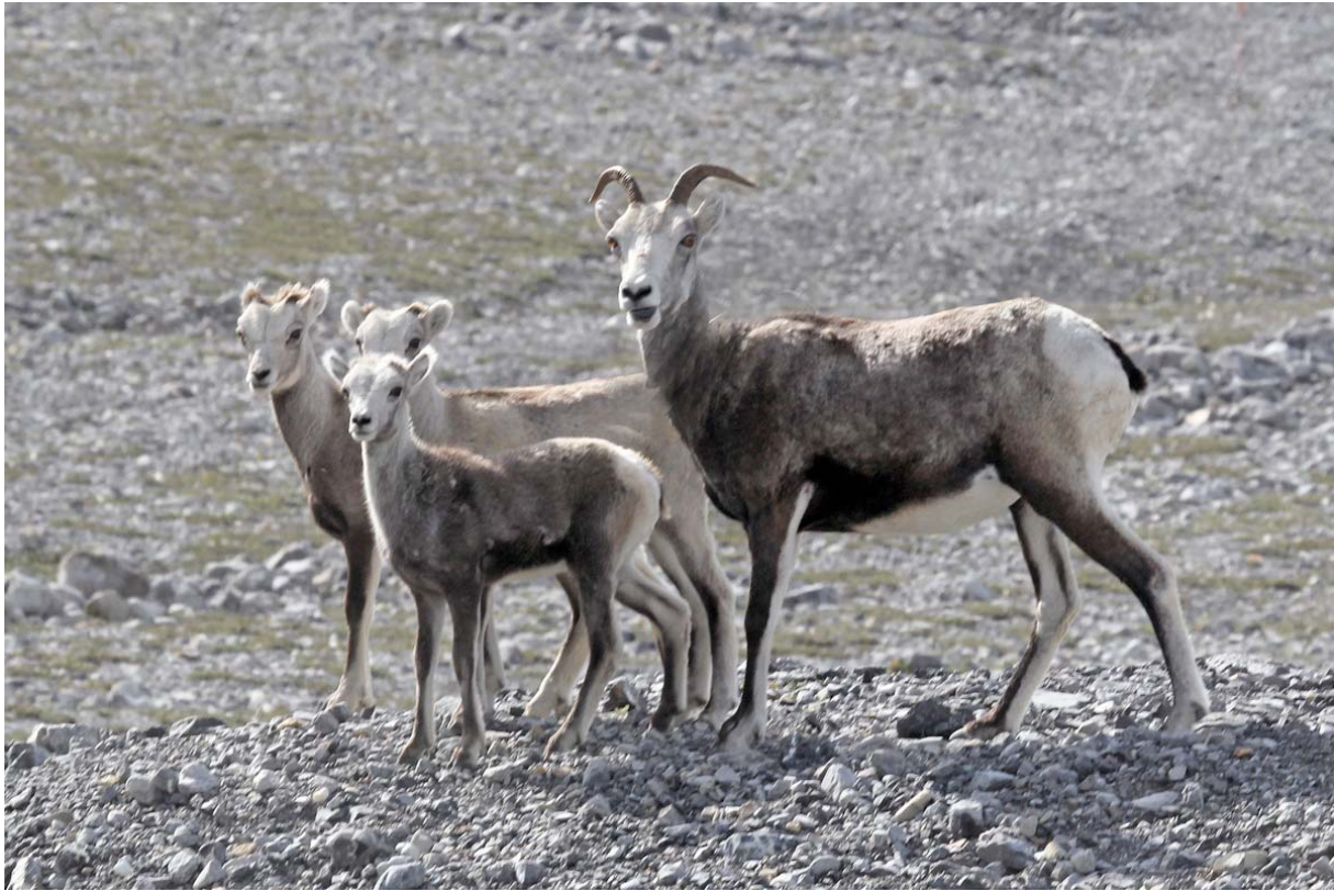
Thin-horned ("Stone") Sheep – female and juveniles Muncho Lake Provincial Park, BC