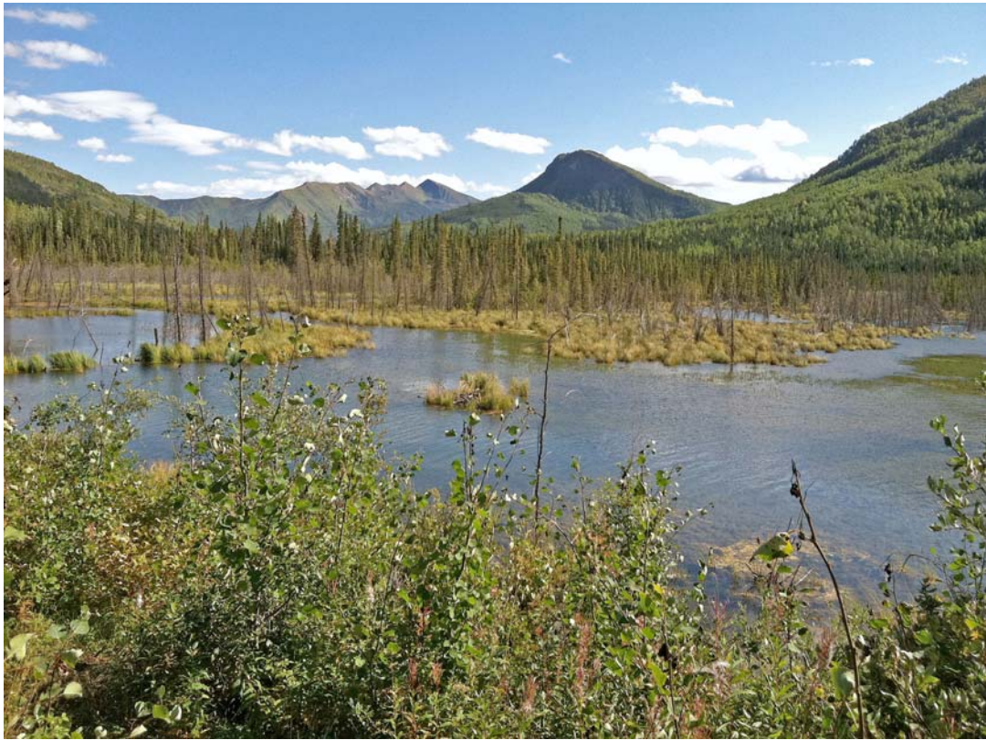
Toad River from campsite Toad River Lodge and RV Park, Alaska Hwy., BC

The flow is pretty sluggish right here and I can look out the window at what, to my eye, seems to be perfect moose habitat.