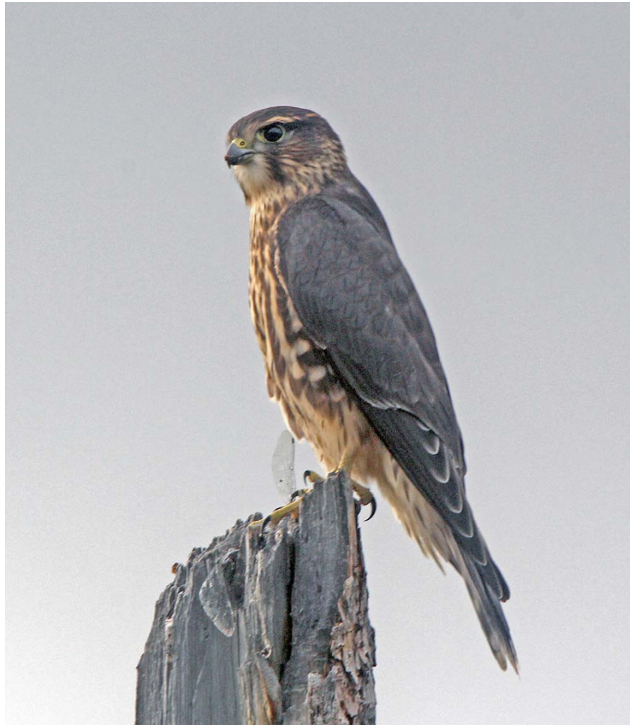
Merlin with dragonfly Discovery Yukon RV Park, Alaska Hwy, YK, near Alaska border