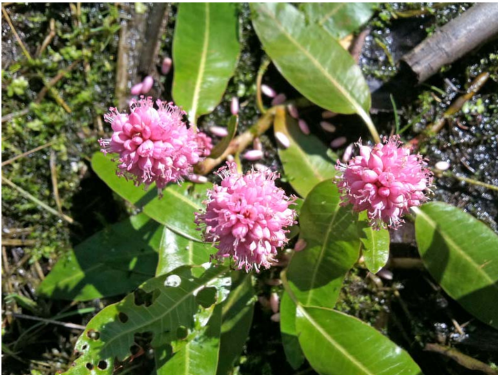
Water Smartweed, Polygonum amphibian – common beside lake Moonshine Lake Provincial Park, AB