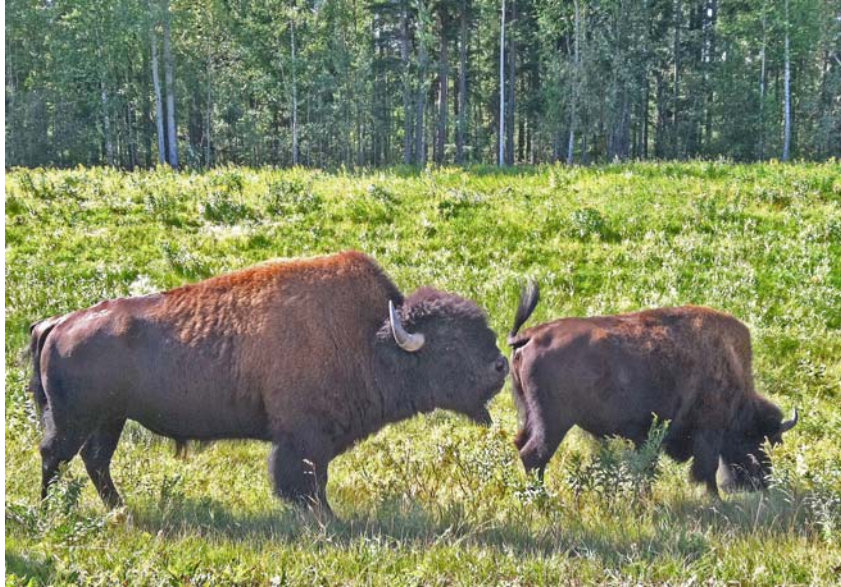
“Woodland” American Bison Alaska Hwy., between Fireside and Liard Hot Springs, BC

that were moseying along the road, paying no attention to the traffic. We stopped for photos, of course. At first they were ahead of us and back-lit, but pretty soon they wandered right by the truck window, and I even got some i-Phone shots at extremely close range. After correcting the exposure and contrast with PhotoShop, they were excellent.