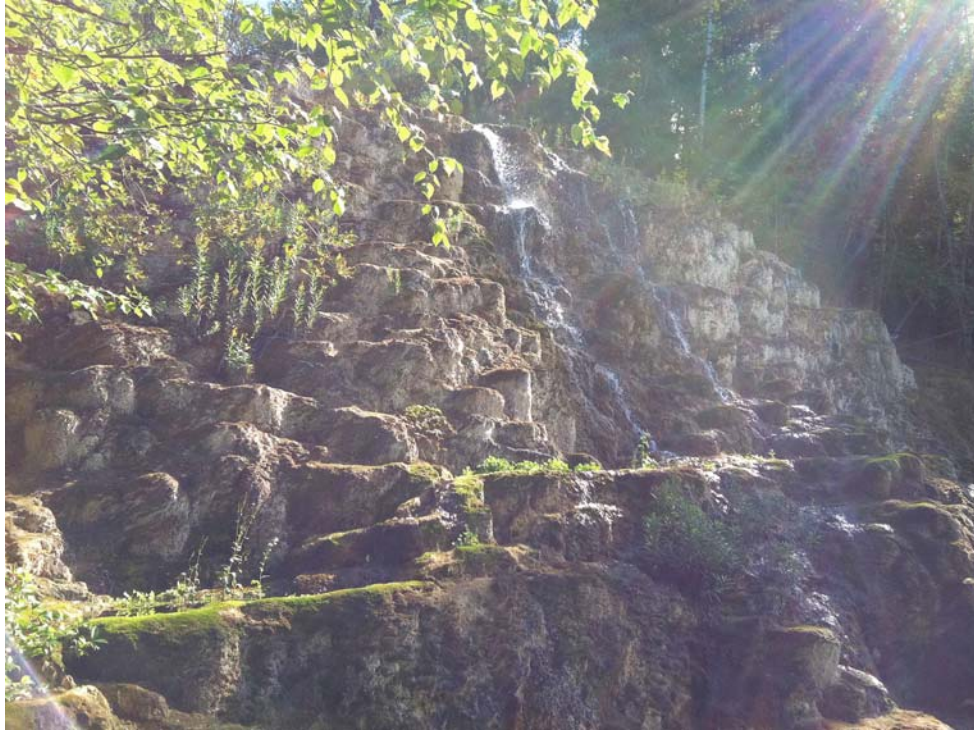
Hanging Garden Liard Hot Springs Provincial Park, BC

Countless people charged past me up and down the boardwalk totally oblivious of the beautiful plants in early fall color on either side. Above the bathing pool a series of steep stairways led to a view of the hanging gardens, sort of a mini-Mammoth Hot Springs with the same chemistry as at Yellowstone. There were also some special plants there.