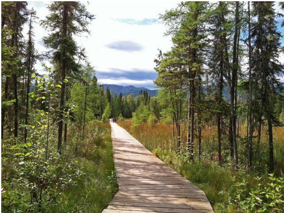
Boardwalk through marsh and forest edge Liard Hot Springs Provincial Park, BC

This is reached via a 600-meter boardwalk.