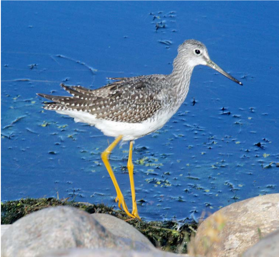
Greater Yellowlegs Moonshine Lake Provincial Park, AB

While I was dallying with a plant that turned out to be a common alien, Jim went on ahead and came upon a mixed flock of about twenty Greater and Lesser yellowlegs resting on the lake's shore bank. He said he was absolutely thrilled when the first bird on the bank not only allowed him to slowly walk to within twenty feet of it, but then it led the whole group slowly parading by right in front of him, one by one, even closer than twenty feet, allowing him to get fantastic photos. Each bird looked at him quizzically as it walked by, but showed no sign of fear--this despite the fact that the Canon 60D camera he was using at the time has a fairly loud shutter noise.