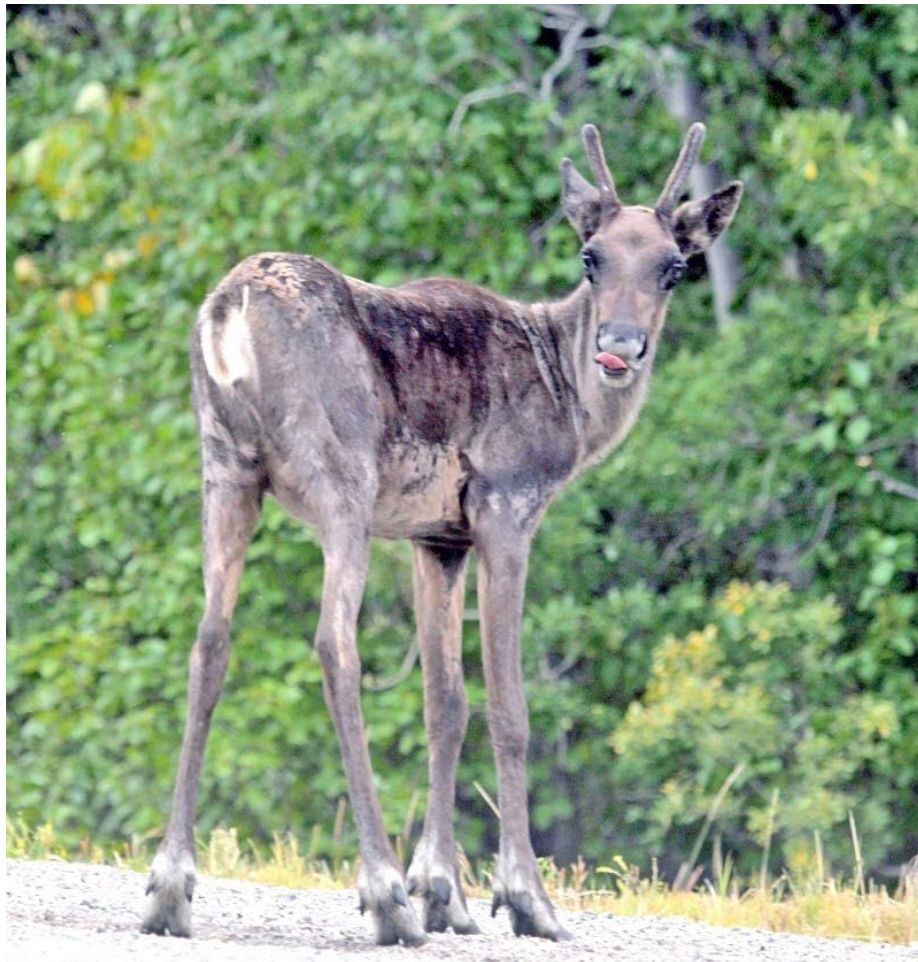
Caribou – female Alaska Hwy. east of Toad River Lodge, BC