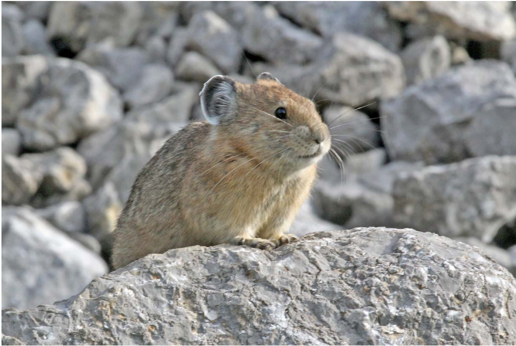
Pika Jasper National Park, AB