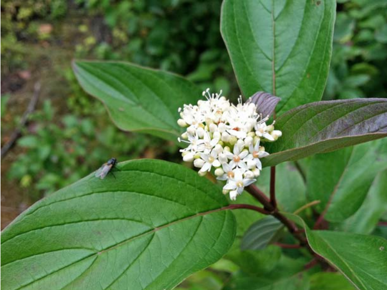
Black Fly on Red-osier Dogwood, Comus stolonifera Liard Hot Springs Provincial Park, BC

Red-osier Dogwood, Cornus stolonifera . (One photo clearly showed a Black Fly.)