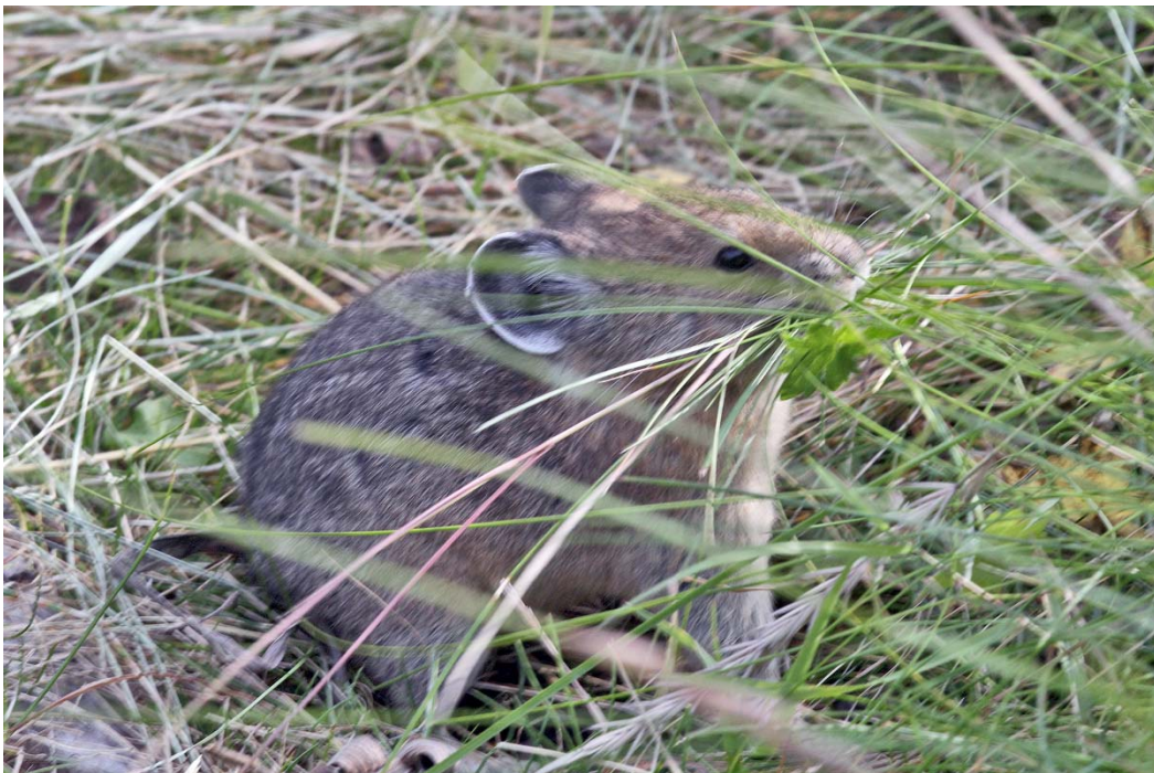
Pika gathering grass Jasper National Park, AB