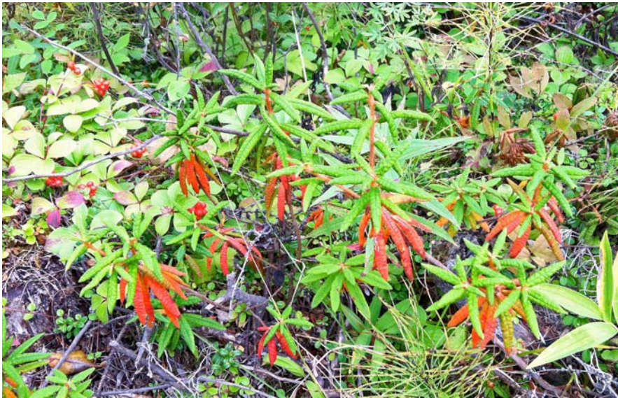
Labrador Tea in fall color, Ledum groenlandicum Liard Hot Springs Provincial Park. BC

Labrador Tea, Ledum groenlandicum (I've seen this many times in flower, including this summer, but now some of the leaves have turned brilliant crimson. Beautiful! This is not the same species I photographed in Tuktoyaktuk.)