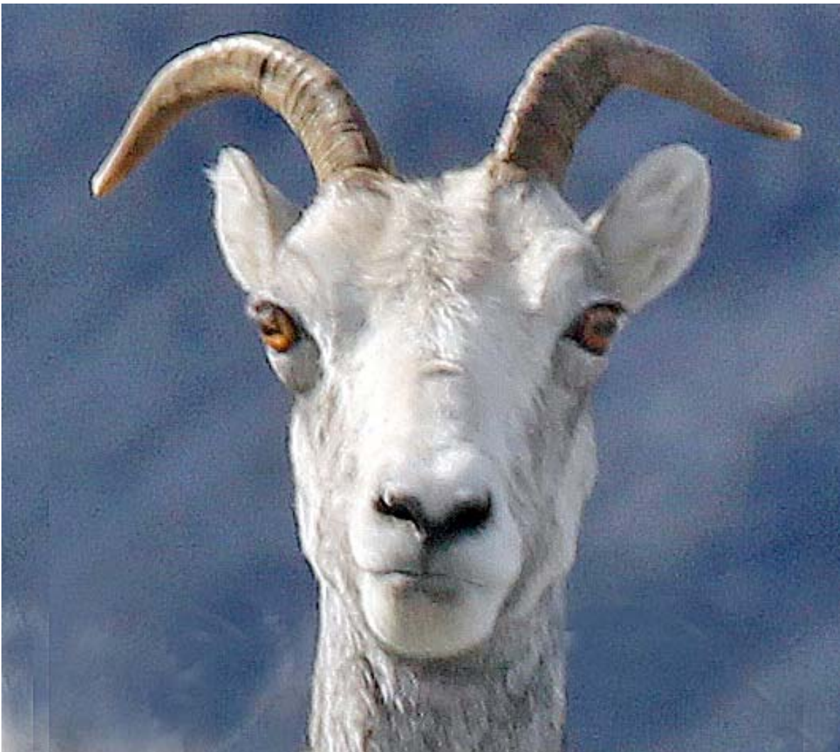
Thin-horned ("Stone") Sheep – female Muncho Lake Provincial Park, BC

The animals were grouped tightly together all licking the gravel on the side of the road. They paid absolutely no attention to the cars and trucks whose occupants had stopped to watch them. Jim actually got out of the truck and approached them with his telephoto lens in order to get a better angle to the sun. There must have been about 30 animals--males, females and young. They were in two tightly packed groups--actually in physical contact it looked like to me from the truck. There was no vegetation beside the road, so perhaps they were going for minerals. Anyway, Jim shot a lot of pictures and was very happy when he came back. [Later: They were wonderful--so wonderful I had to include four of them with this diary.