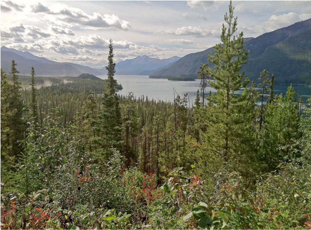
Muncho Lake Muncho Lake Provincial Park, BC

We hadn't driven much farther when we entered Muncho Lake Provincial Park,