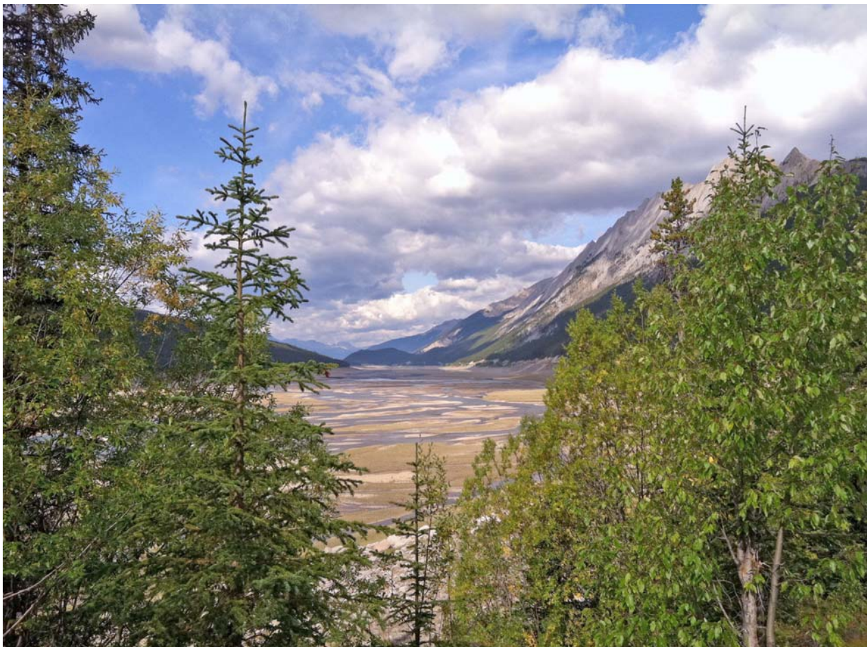
Medicine Lake through trees Jasper National Park, AB

On our way back, we viewed the scenery from a different angle and the mountains were spectacular framed by the trees on either side of the road. I took one photo of Medicine Lake through the trees with mountains behind and beautiful puffy clouds and blue sky above. I consider it one of my best shots of the trip.