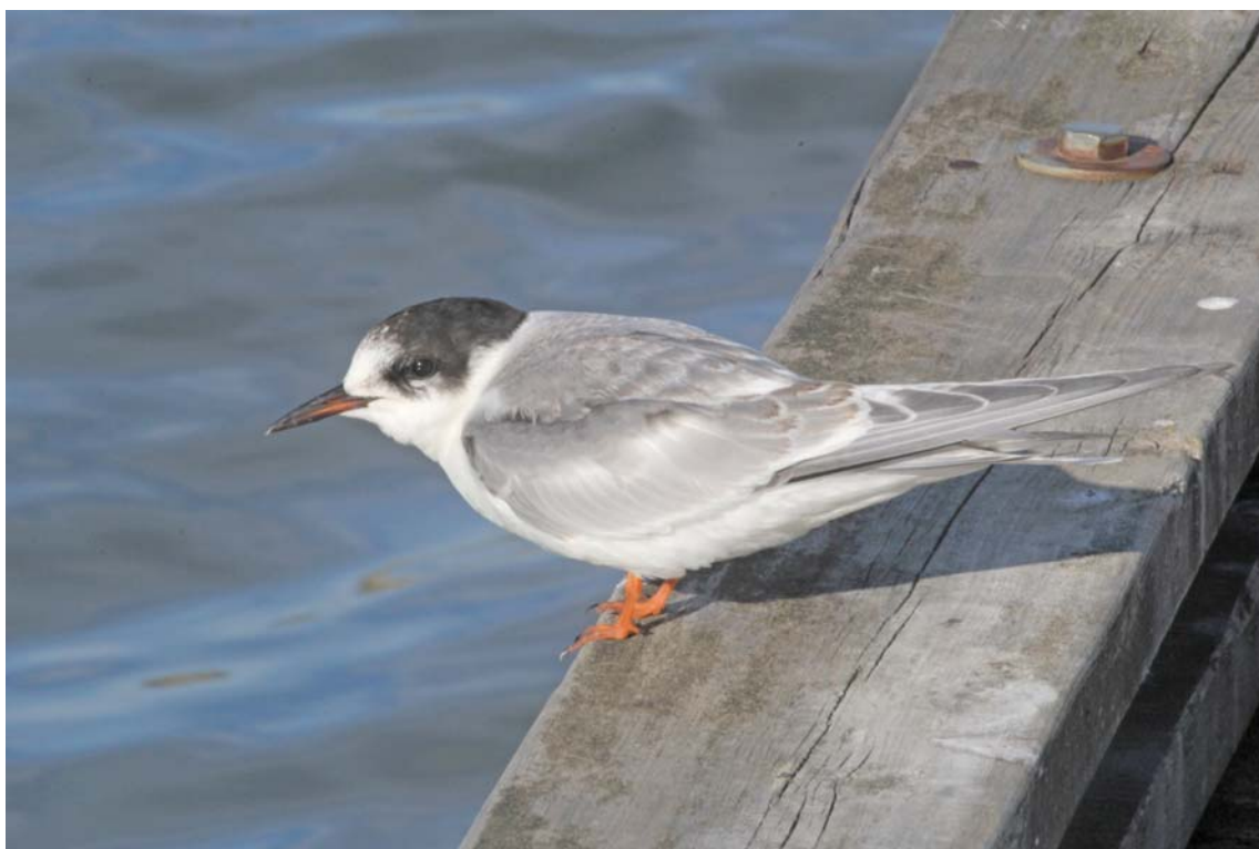
Common Tern, immature Winagami Lake Provincial Park. AB

This morning we did better. We drove to the day-use portion of the park, where I found a flock of American Pipits, a few Black-capped Chickadees, and a single Yellow-headed Blackbird and probable Marsh Wren that popped up and back down into the cattails. But we hit the jackpot on the boardwalk railing out to a little breakwater. There we found a flock of about 20-30 Common Terns plus a single Bonaparte's Gull. The terns were both adults and juveniles and in various stages of molt. They paid no attention to Jim as he gradually approached them to the distance he wanted to be. He must have photographed those birds for nearly an hour. He has never gotten Common Tern in these plumages before. The light was so good that he also got out his film camera and shot a lot of slides with that, too.