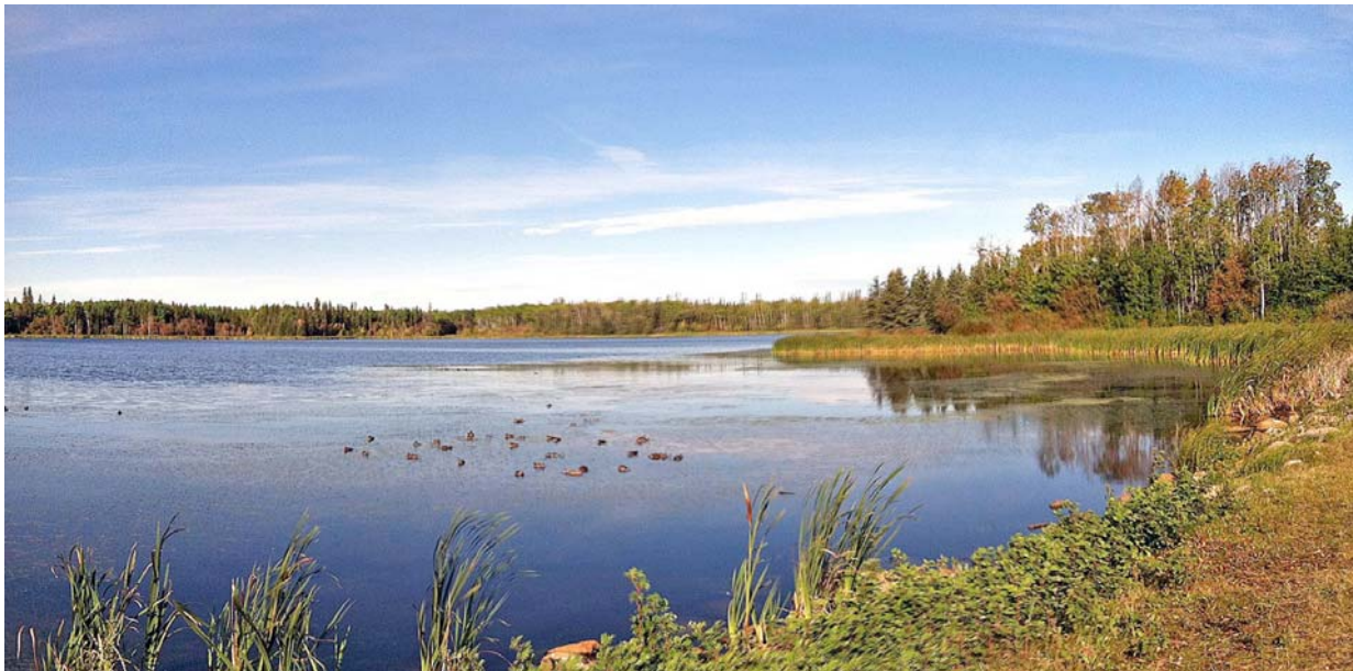
Moonshine Lake with ducks – panorama Moonshine Lake Provincial Park, AB