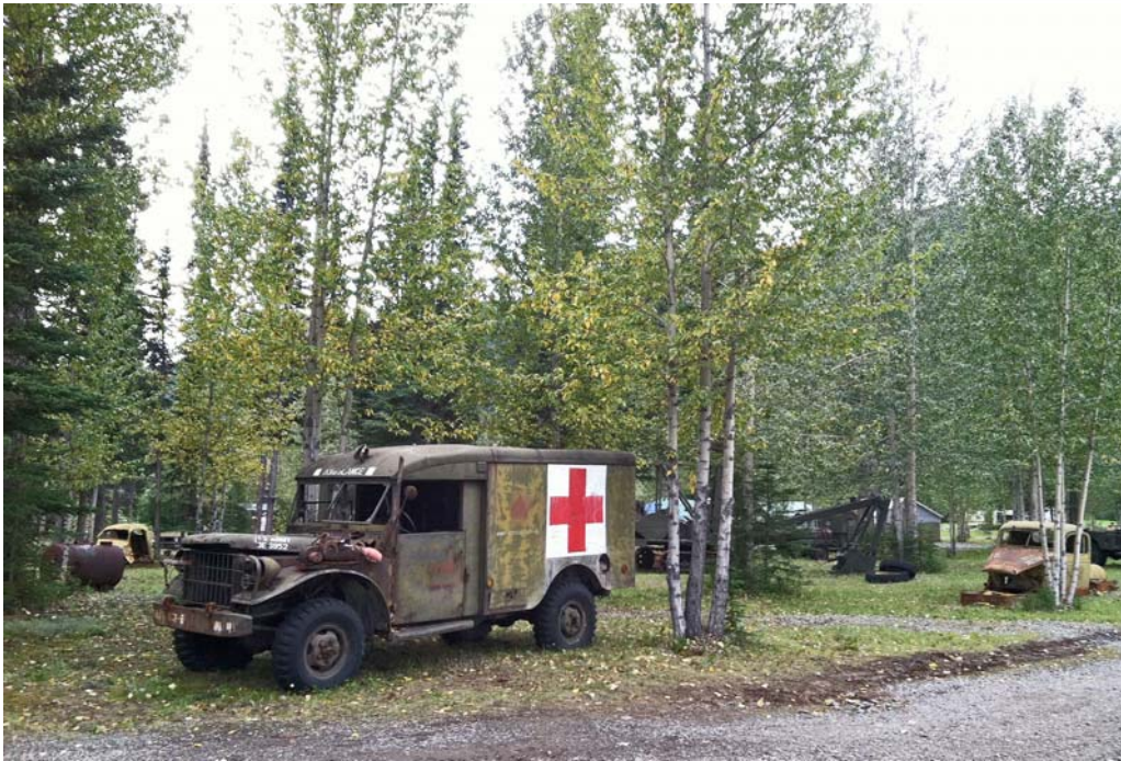
Army ambulance from 1940s Discovery Yukon RV Park, Alaska Hwy., YK, near Alaska border