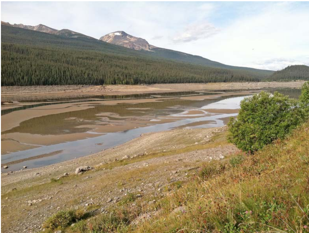
Medicine Lake Jasper National Park, AB

Medicine Lake is an interesting place geologically. Signs which I photographed explain: In the early summer during the peak of snow-melt water, the lake is full, but gradually it disappears during the course of the summer leaving a mudflat, and that's what we saw. (I think we have early summer photos at home when it was full.) For a long time no one knew where it went. The Indians thought it was bad medicine or magic and were afraid of it. Now the geology has been worked out. The lake drains out through a series of constricted underground tubes; a diagram was on a sign & I photographed it. They're too narrow to allow the early summer snowmelt to flow out, so it backs up for a while, but gradually drains away over the summer. We saw the lakebed with about a 50:50 mix of mudflats and shallow water. There were lines of large animal tracks (moose? bear? caribou?) all over the mud, but where they were visible the road was far above the level of the lake so we couldn't identify the tracks.