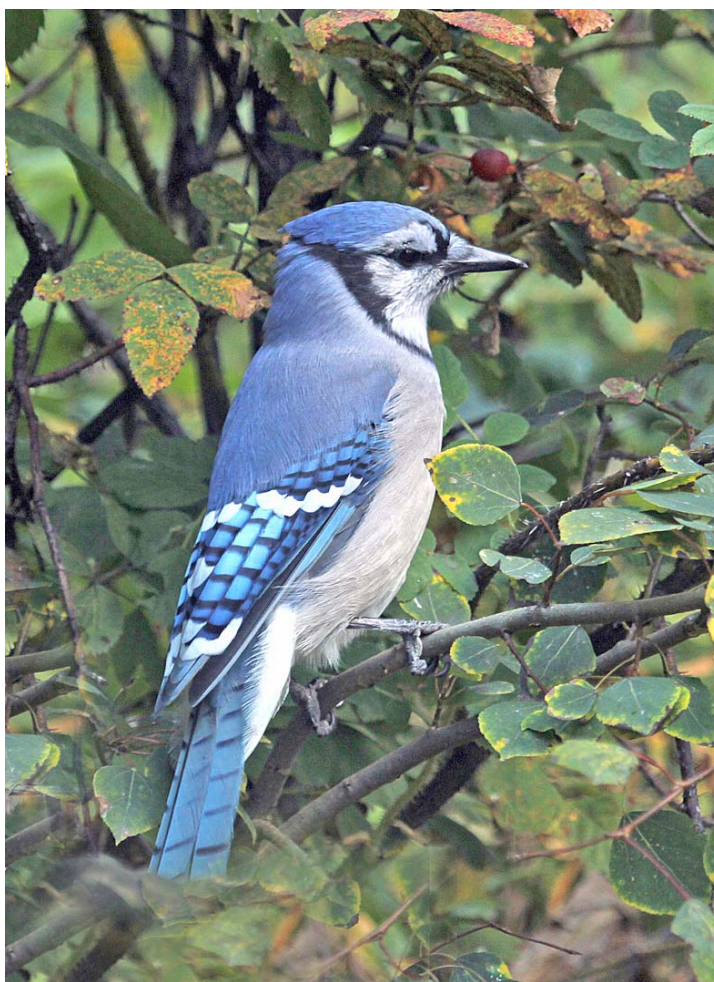
Blue Jay Moonshine Lake Provincial Park, AB

We had no sooner set up camp when a bird flew into a spruce tree near our site. It took no more than a glance to discover it was a Blue Jay.