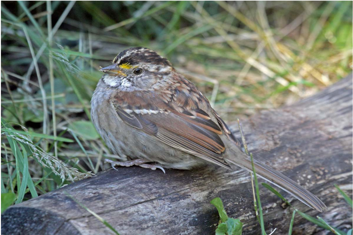
White-throated Sparrow Moonshine Lake Provincial Park, AB

Friday morning, Sept. 2, when I raised the shades and peeked out at Jim's feeding station, I discovered a new species in addition to the juncos and Blue Jays. The light was dim and the birds were wet, so at first I thought some or all were Swamp Sparrows. Further examination revealed that they were all White-throated Sparrows. Some seem to be immatures and the rest fall adults. None is truly white-striped, but one might turn out to be that in breeding plumage. I'll have to look up the details in my sparrow books when I get home. There are up to four of these birds and they've been around our site ever since.