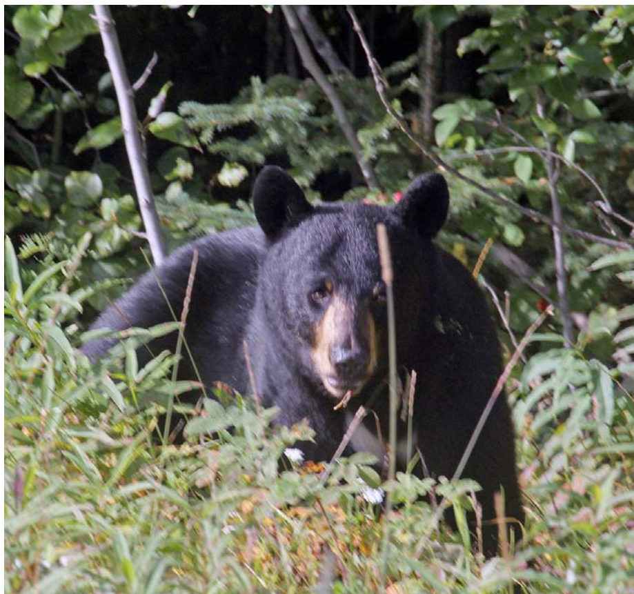
Black Bear Alaska Hwy. west of Muncho Lake Provincial Park, BC

A bit farther down the road there was a Black Bear in the wide clearing along the roadside. Usually these animals head into the woods right away, but this one just kept on eating. Jim got out of the truck and approached it somewhat, but with a telephoto lens. The animal looked up at him from time to time, then put its head back down and ate some more of whatever it was finding in the roadside vegetation. After two or three minutes, it finally ambled off into the forest, but Jim blazed away whenever it put its head up.