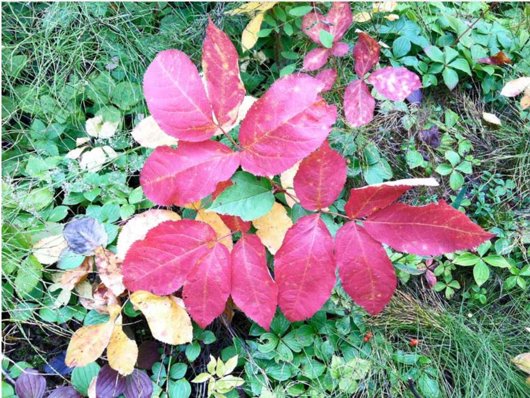
Wild Sarsaparilla, Aralia nudicaulis Liard Hot Springs Provincial Park, BC