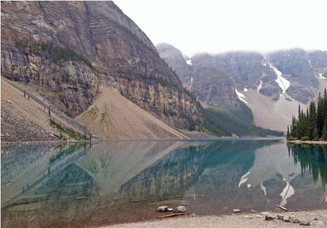
Moraine Lake Banff National Park, AB

On our way to Moraine Lake I had spotted some plants with brilliant red leaves. On the way back we stopped and I got some pictures. They turned out to be Red Bearberry, Arctostaphylos rubra --related to the Manzanitas.