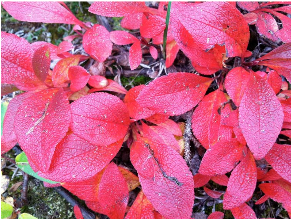
Red Bearberry, Arctostaphylos rubra Moraine Lake Rd., Banff National Park, AB