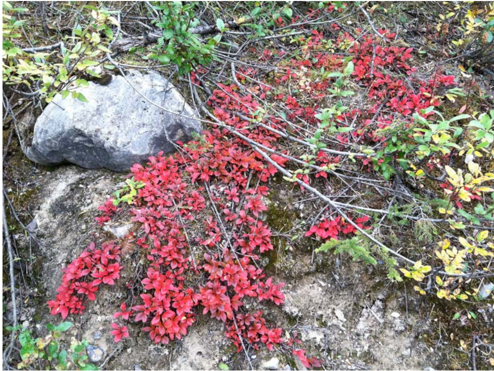
Red Bearberry, Arctostaphylos rubra Moraine Lake Rd., Banff National Park, AB