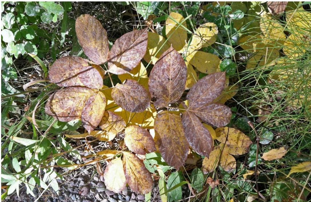
Wild Sarsaparilla, Aralia nudicaulis Glacier National Park, MT