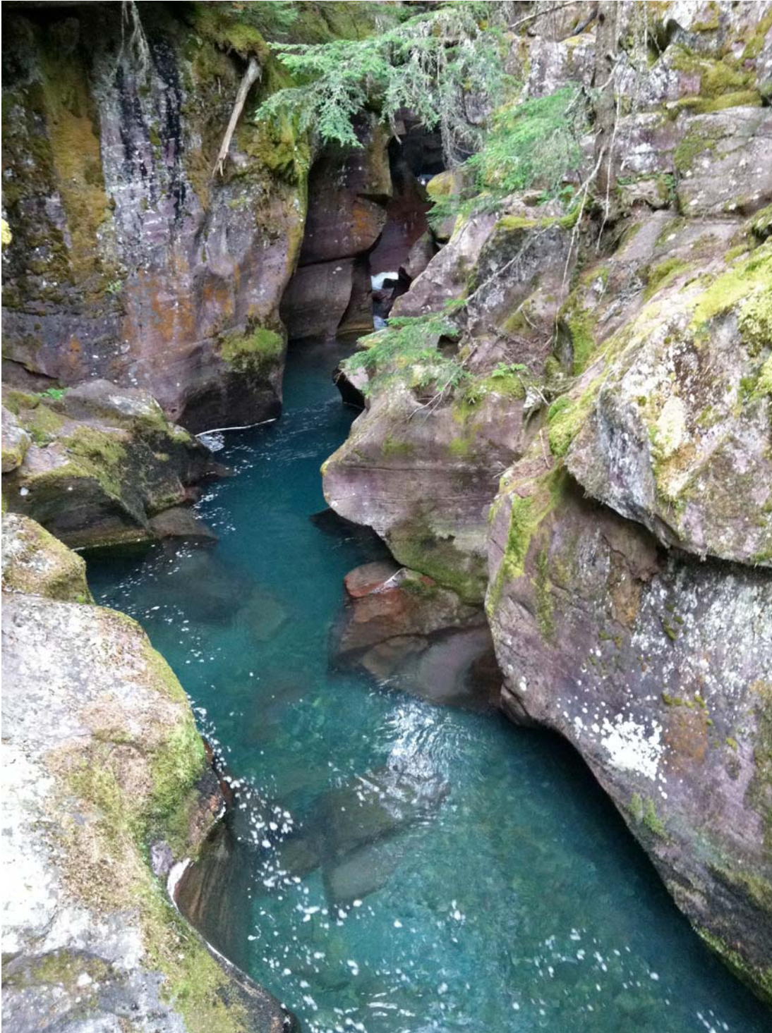
Avalanche Gorge Trail of the Cedars, Glacier National Park, MT