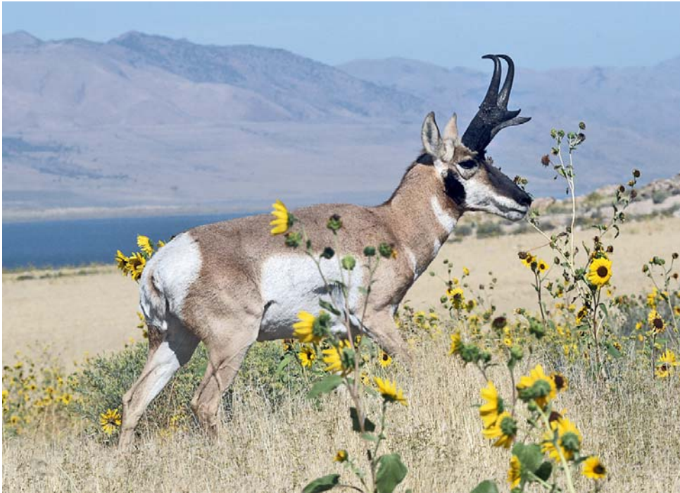
Pronghorn Antelope Island, Great Salt Lake, UT

Finally, as we were driving through the campground to check it out, we saw a Coyote in some fairly tall brush in one of the unoccupied campsites. Jim shot a lot of pictures, but whether any will be clear shots remains to be seen.