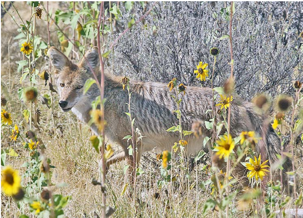
Coyote Antelope Island, Great Salt Lake, UT

Finally, as we were driving through the campground to check it out, we saw a Coyote in some fairly tall brush in one of the unoccupied campsites. Jim shot a lot of pictures, but whether any will be clear shots remains to be seen.