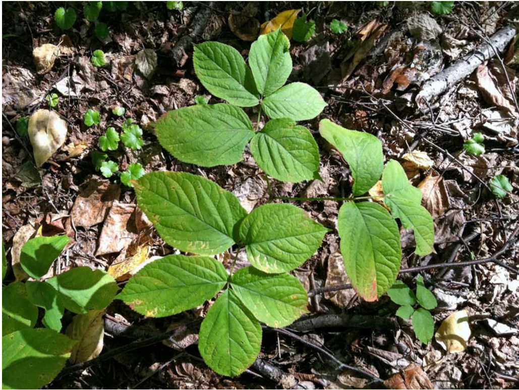
Wild Sarsaparilla, Aralia nudicaulis Liard Hot Springs Provincial Park, BC