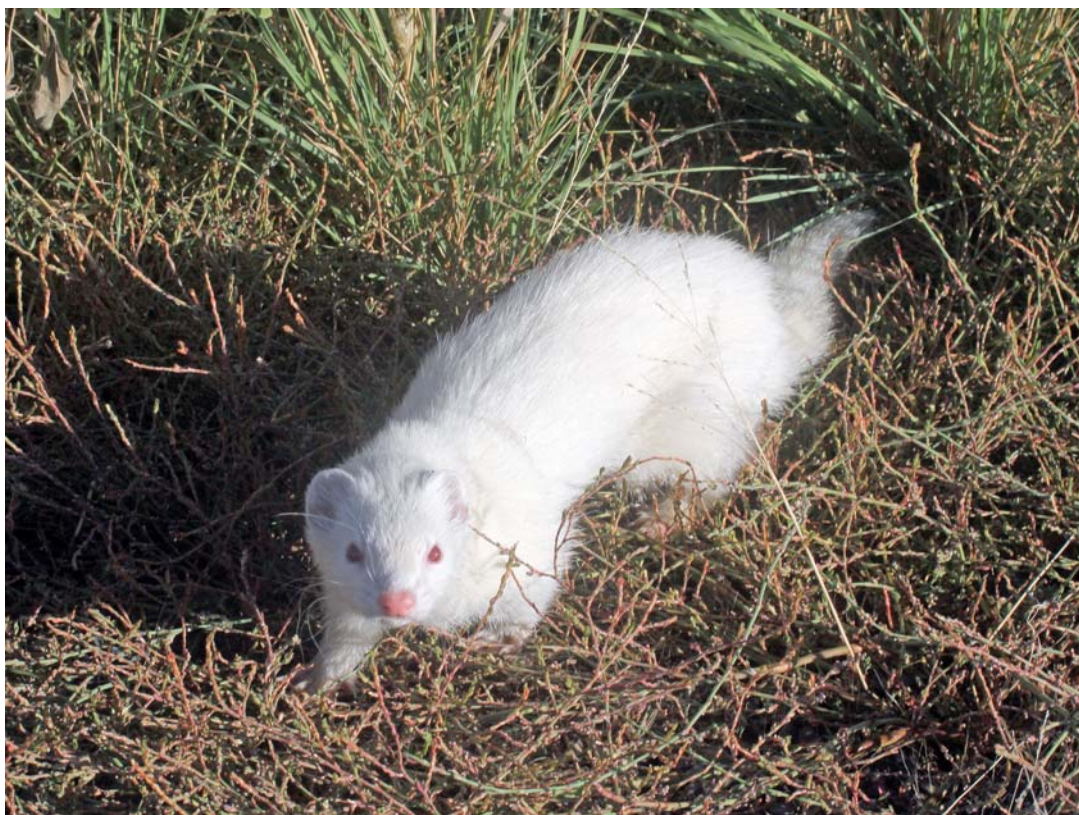
Long-tailed Weasel – albino Road to Bear River National Wildlife Refuge, UT

At one point I looked ahead and saw a small white animal crossing the road. Puzzling! What could it be? I was driving and approached it carefully and we could see that it was shaped like a weasel, but it's too early in the fall for a winter coat. Jim told me to pull closer and let him out close to where the creature had disappeared. He then walked up and stopped where he thought the animal might be. He stood there for about five minutes and was just about to leave when the all-white animal crawled out of the knee-high marsh grass and lay down only two feet in front Jim's feet! Luckily, Jim was using his 100-400 lens which allowed him to photograph the creature even at that close range. He said when he backed up a little more to shoot it at a different angle, the creature began again to crawl toward him. Having recently read a book about rabies-infected mice killing early homesteaders in Canada, Jim began walking backwards toward the truck, keeping ahead of the creature following him--but still shooting photos, of course. When he got to the truck, he jumped in and the animal disappeared underneath the truck. We didn't want to run over it, but I started the engine and was happy to see it run out and stand beside the road as we drove off. During all this close-up viewing, we were able to see that the animal was indeed a Long-tailed Weasel and a true albino. It had a pink nose, eyes, and orbital ring. And Jim's photos were superb!