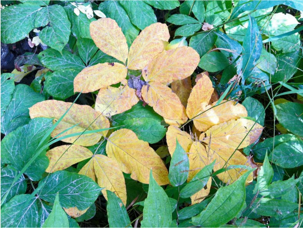
Wild Sarsaparilla, Aralia nudicaulis Glacier National Park, MT

The Duncans had told us of a restaurant called The Glacier Grill--about five miles west of the KOA in the village of Coram. It's a relatively unprepossessing family restaurant, but the food was outstanding. Jim ordered a hot beef sandwich, which came with clam chowder. I tasted his chowder and had to have a cup, too. It was excellent. I also ordered a salad with grilled chicken, cranberries, walnuts, feta cheese, bacon, spinach and a choice of dressings. I couldn't resist trying the huckleberry vinaigrette, and it was delicious. The prices were very low, especially when compared with what we've been paying for awful food in Canada and Alaska.