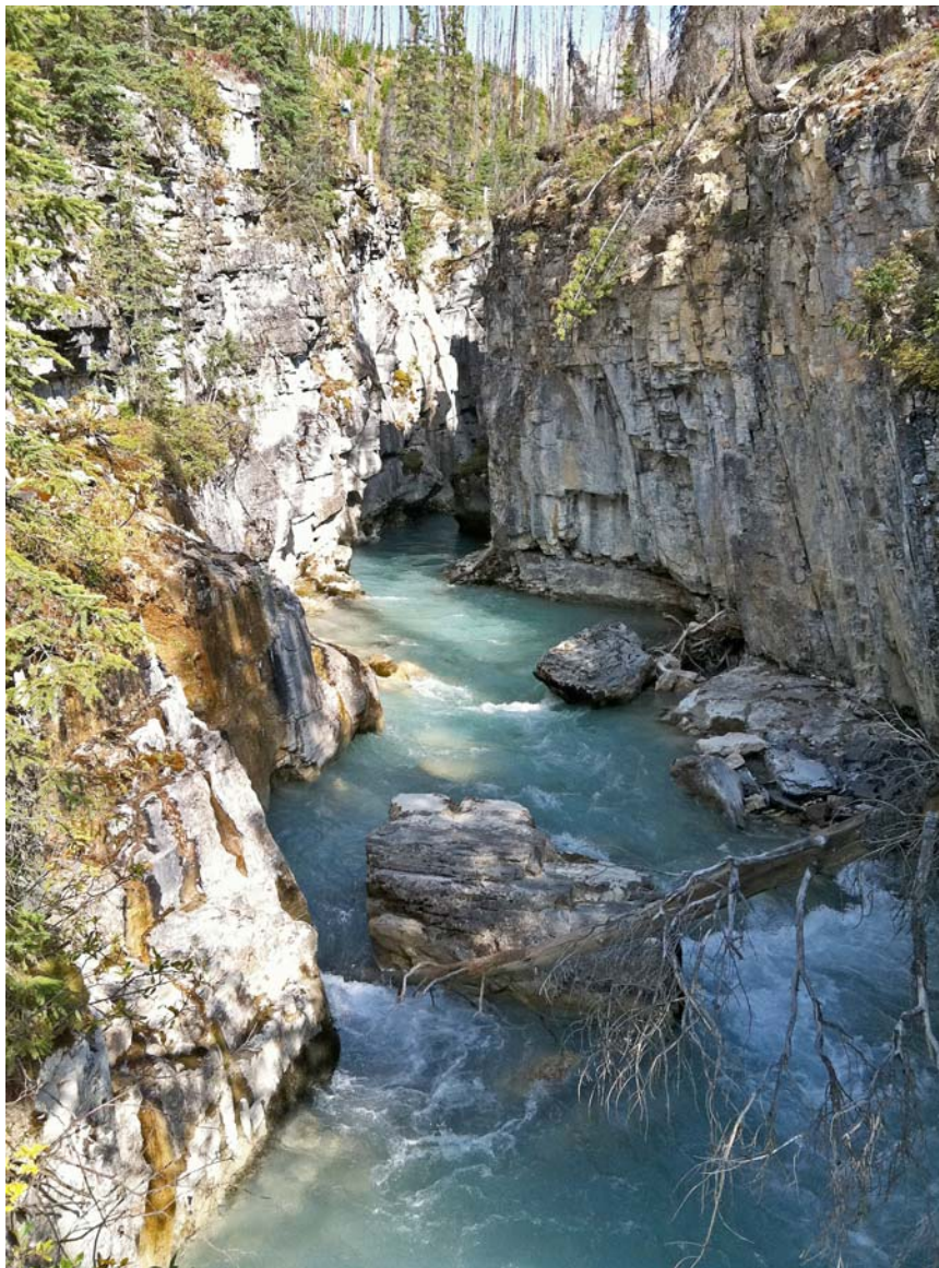
Marble Canyon Kootenay National Park, BC

The canyon was produced during the uplift of the Rockies, when "marble" (actually a mixture of calcium and magnesium carbonates, so partly dolomite) cracked open when a part of the old seafloor buckled upward. A creek found its way into the crack and is slowly cutting it deeper. The place is really very beautiful without any swifts and well worth a stop.