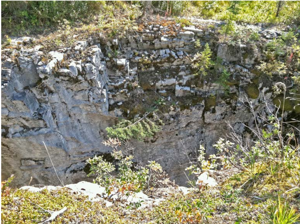
Possible Black Swift nest sites Marble Canyon, Kootenay National Park, BC

We continued down the Kootenay River valley, then over a mountain ridge, and ended up at Canyon RV Resort in Radium Hot Springs. The RV park was nearly full, probably because the national park campground in that area was closed all season for refurbishing. Actually it's a very nice RV park and set in a deep canyon with a creek running through it. It's been nicely landscaped with typical riparian canyon trees on turf. Lots of flowers--English ones--have been planted; Canadians love flowers. In fact, all the motels and even the gas stations, in town have hanging baskets of flowers, mainly petunias, so the entire resort town is very attractive. The principal attraction is the hot springs. I hope they don't live up to their name and actually have radium in them. Although that used to be considered healthy and a cure for all sorts of diseases from cancer to arthritis, it's not anymore.