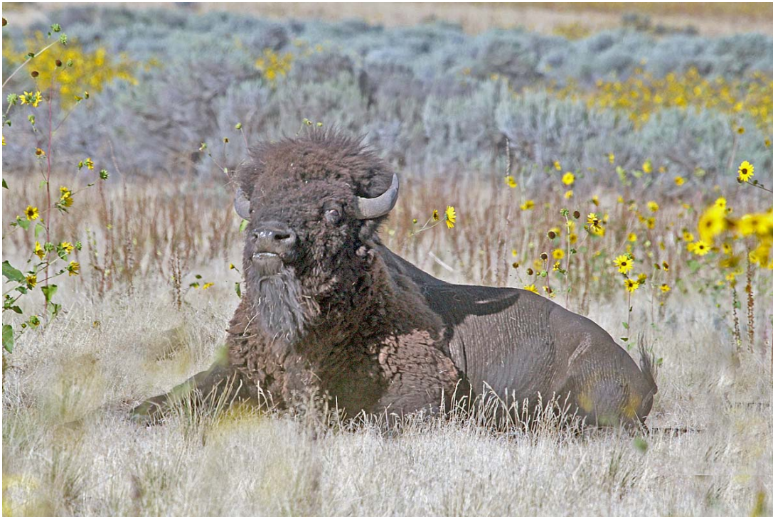
"Plains" American Bison Antelope Island, Great Salt Lake, UT

The best sightings of the morning were mammals and Jim got photos of all. First was a Plains Bison (not Woodland Bison as in northern BC) lying down out in a field amidst some tall sunflowers.