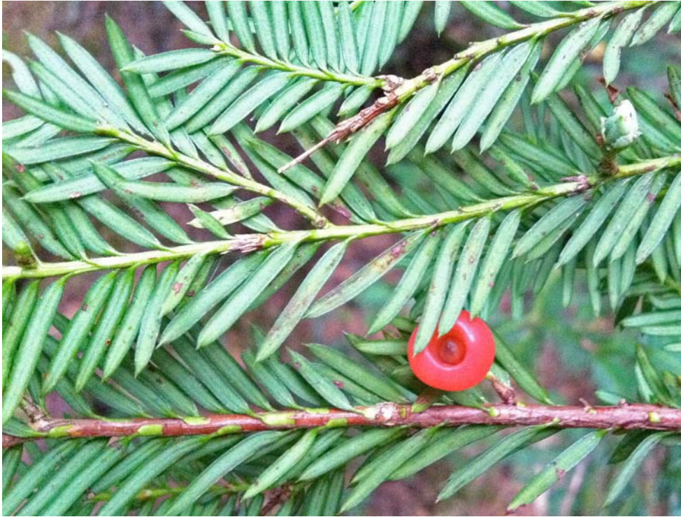
Pacific Yew – fruit and foliage from below Trail of the Cedars, Glacier National Park, MT