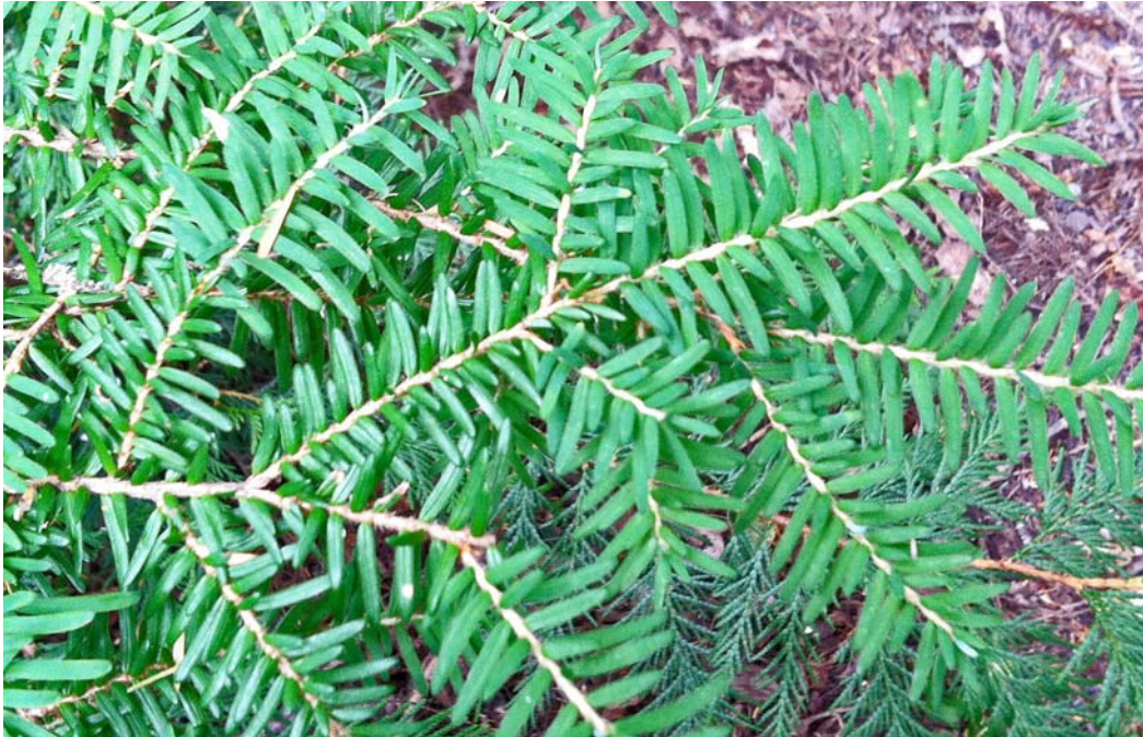
Western Hemlock – foliage Trail of the Cedars, Glacier National Park, MT

I also photographed everything else I could find--Western and Mountain Hemlock, Western Red-Cedar, Western Mountain Maple, and a few shrubs. The trail went between rock walls along Avalanche Creek and at the upper part of the trail, you could look upstream and see where the creek cascaded through a colorful, narrow gorge.