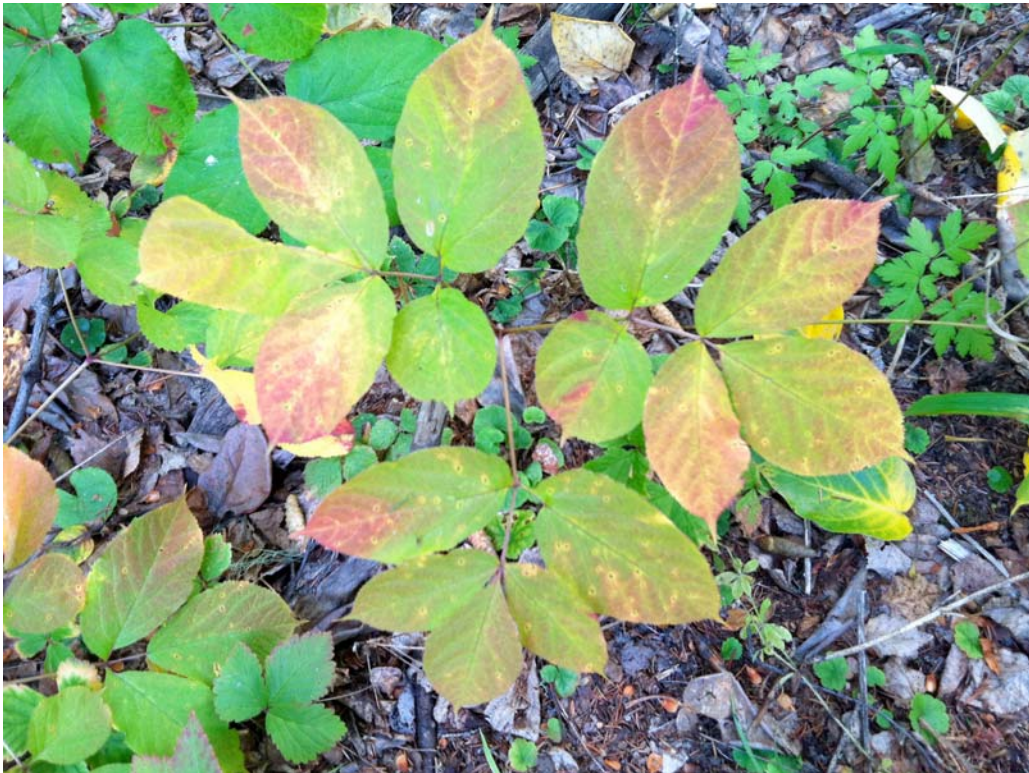
Wild Sarsaparilla, Aralia nudicaulis Liard Hot Springs Provincial Park, BC