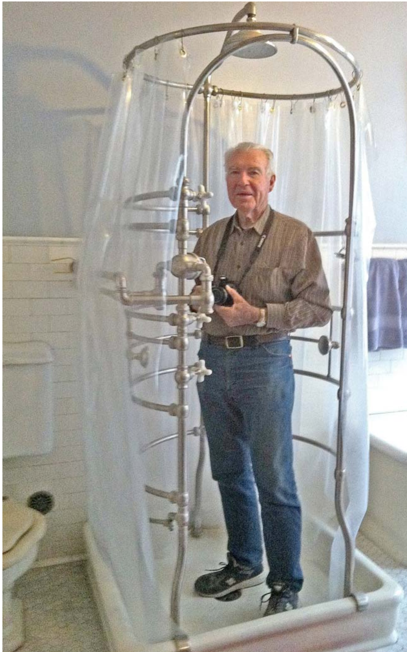
Stall Shower in Copper King Mansion Butte, MT

It was a lavish early 20th century creation and we thoroughly enjoyed the guided tour. Especially interesting was the ingenious shower in one of the bathrooms.