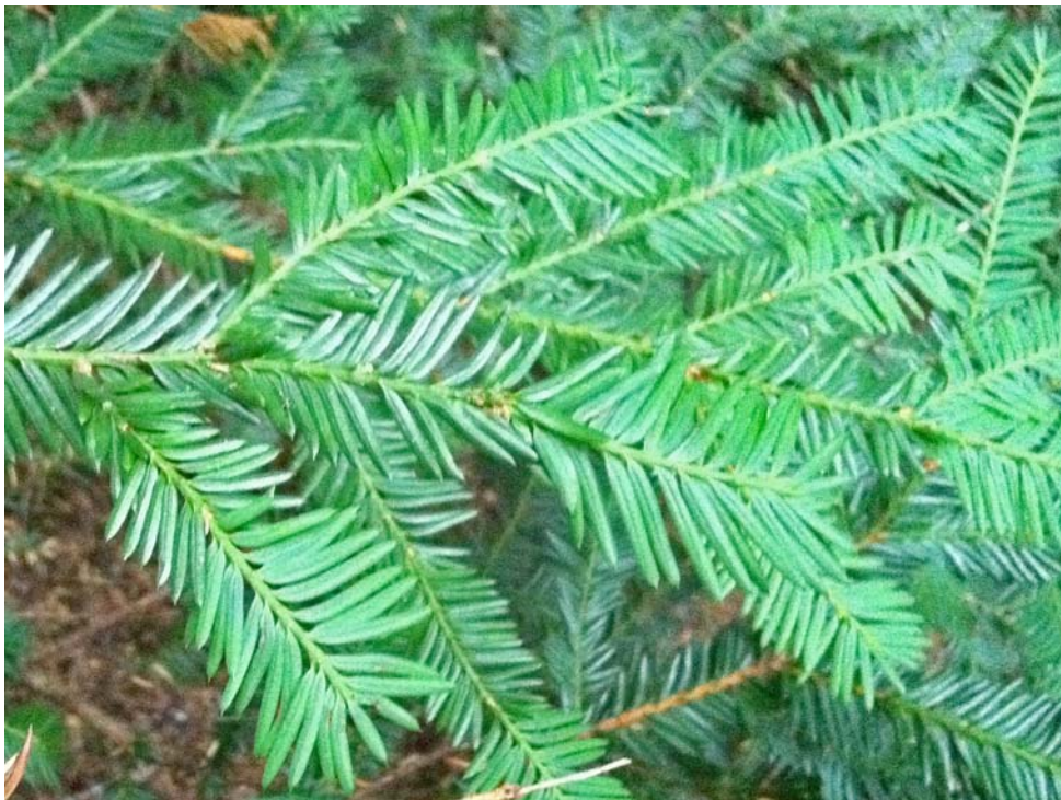
Pacific Yew – foliage from above Trail of the Cedars, Glacier National Park, MT