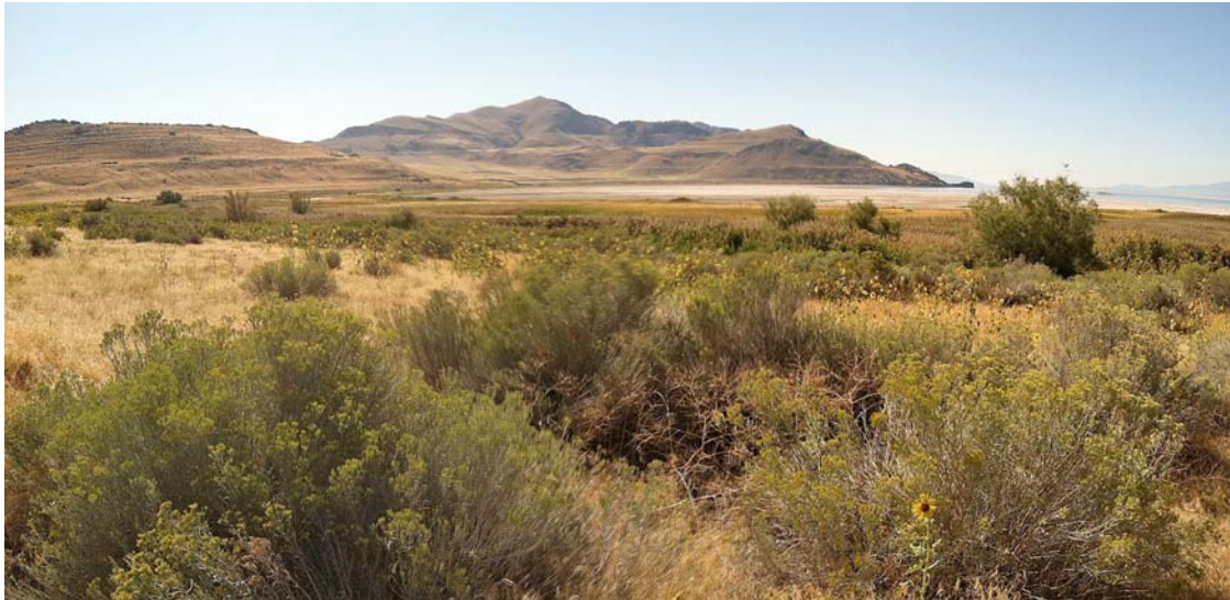
Shrubs and marsh Antelope Island, Great Salt Lake, UT

The day was completely clear and the morning was cool; it warmed up to 80° this afternoon, hotter in the trailer. Along the causeway and on the hillsides of the island were every color from green through olive to the yellow of the fall Rabbitbrush and tall Sunflowers. It was beautiful.