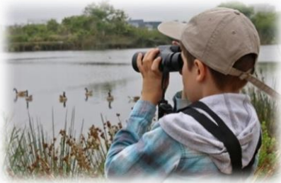
Food Chains and Food Webs

"You did such a great job in these covid times." Camp parent