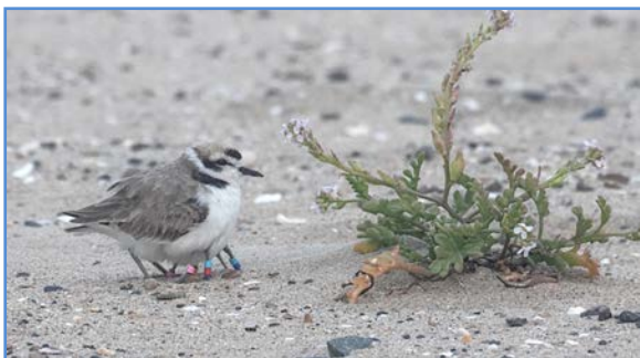
Snowy Plover with chicks

The first accessible birding event of the season will be on Friday, Sept. 26 th at 9:00 am at our traditional location, Irvine Regional Park. This event is designed for anyone who likes a slow-paced, easy walk. Attendees can either bird from our picnic tables or their own portable chairs, or join the guided walk on the paved, flat path around the lake. After birding we will enjoy a bring-your-own brunch. Irvine Park is always a popular destination as it has some of the county's oldest coast live oak and California sycamore trees. There are handicapped parking spaces and handicapped restrooms near our location. Use your OC Park card or pay the $3 park entrance fee. Email Sharon Rockwell at srockwell@writeme.com to register and she will return your email with specific directions for where we will meet.